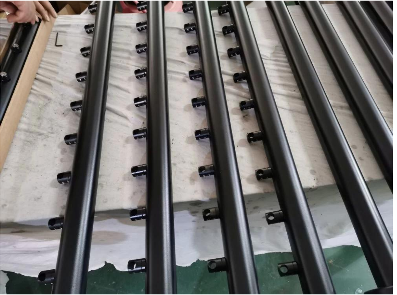
6 Project photos for Stainless Steel Rod Railing System Crossbar Holder Bar Connector