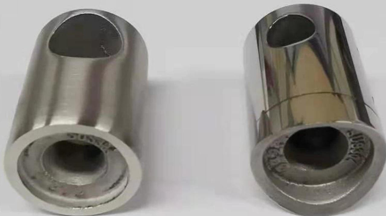
2. Different Size Designs for Stainless Steel Crossbar Holder Bar Connector