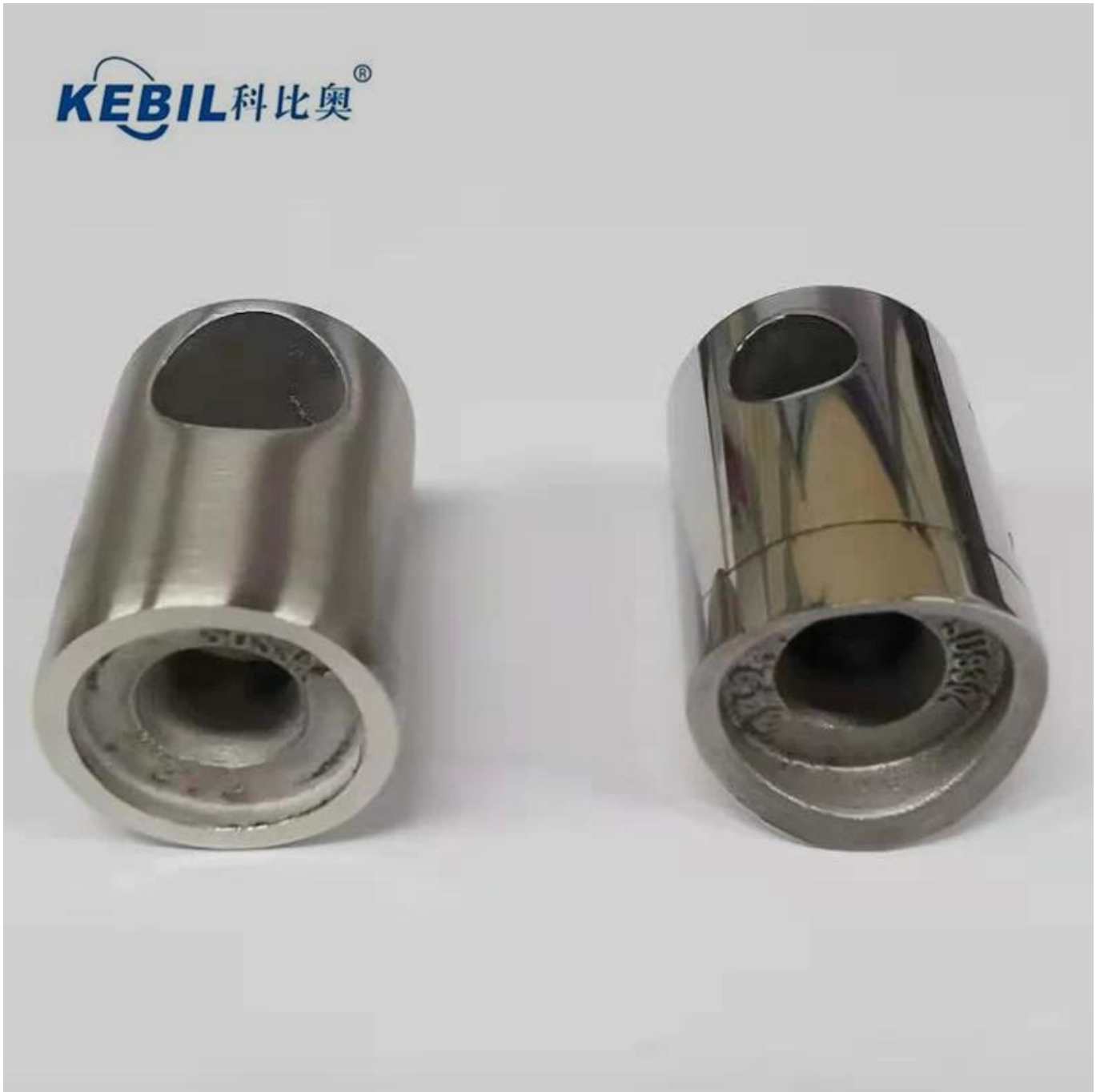
2. Different Size Designs for Stainless Steel Crossbar Holder Bar Connector