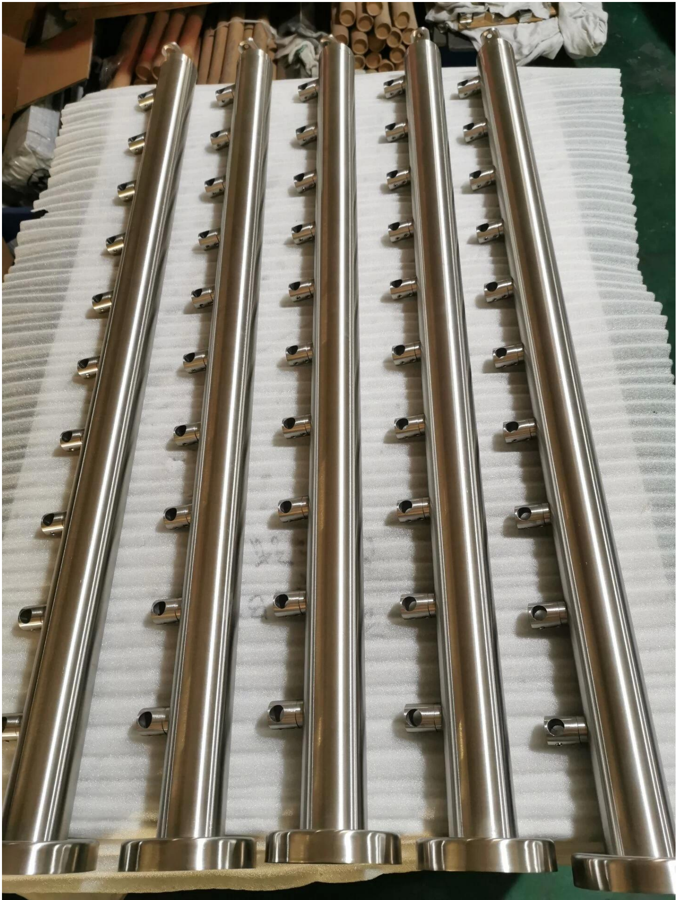
5. Different finishing for Stainless Steel Crossbar Holder Bar Connector