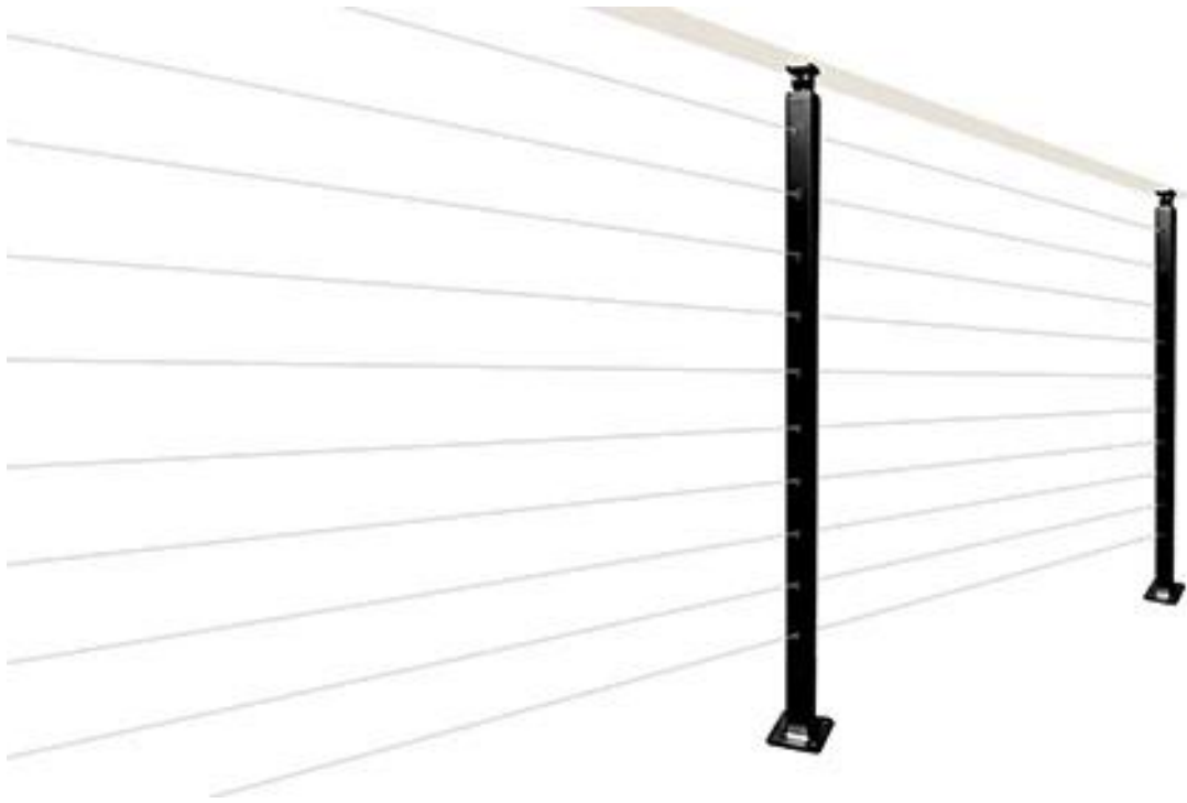
Wire rope tensioner hardware used - Model T803 , swageless type , no need hydraulic crimpers