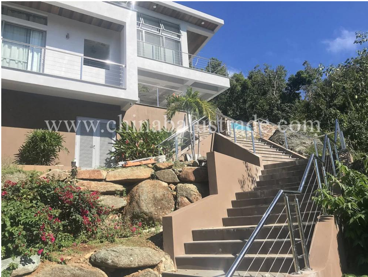
Interior stair design wire rope balustrade handrails