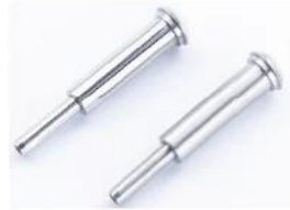
T807- 3mm/4mm cable