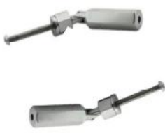
T801- 3mm/4mm cable