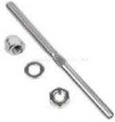
T805- 3mm cable