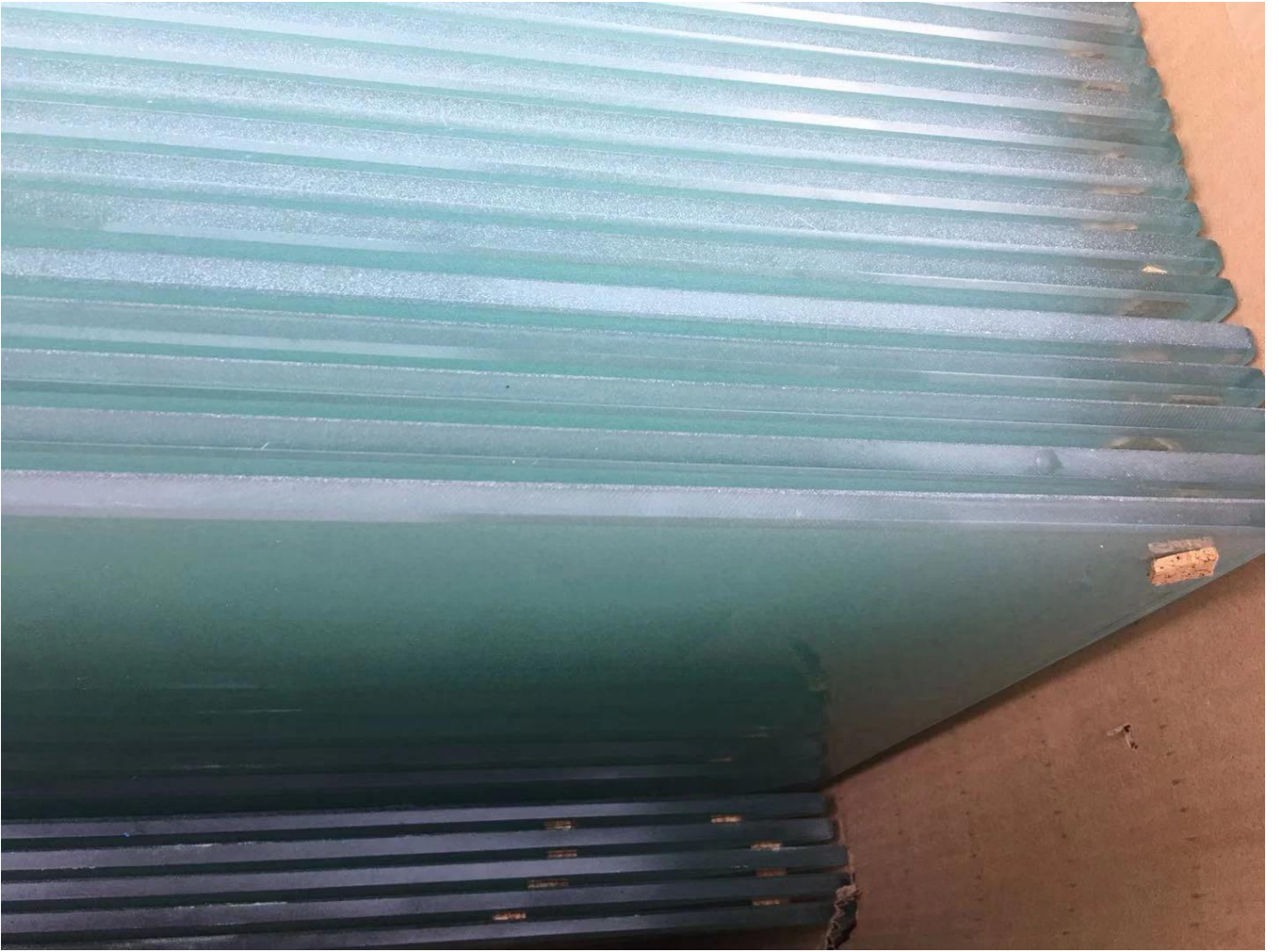
Equipment for production