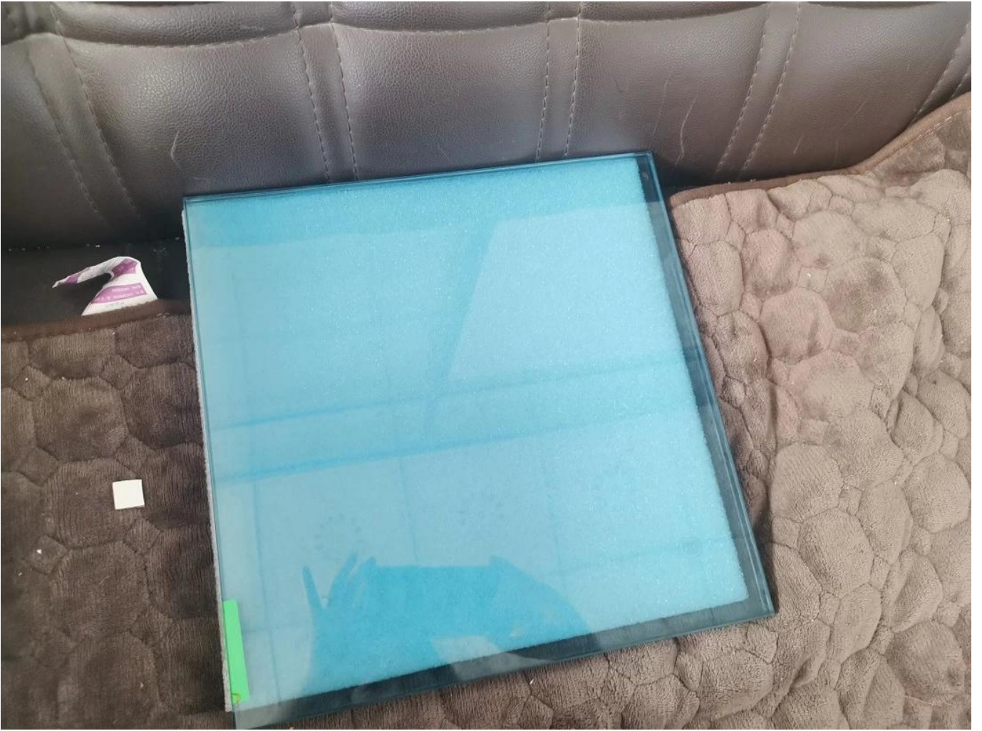
Grey color tempered glass: