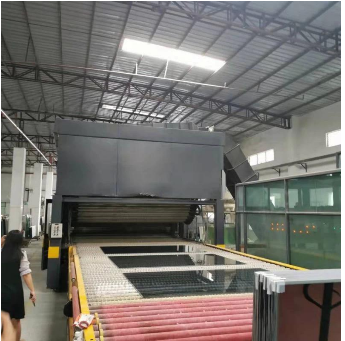
Production & Packing: