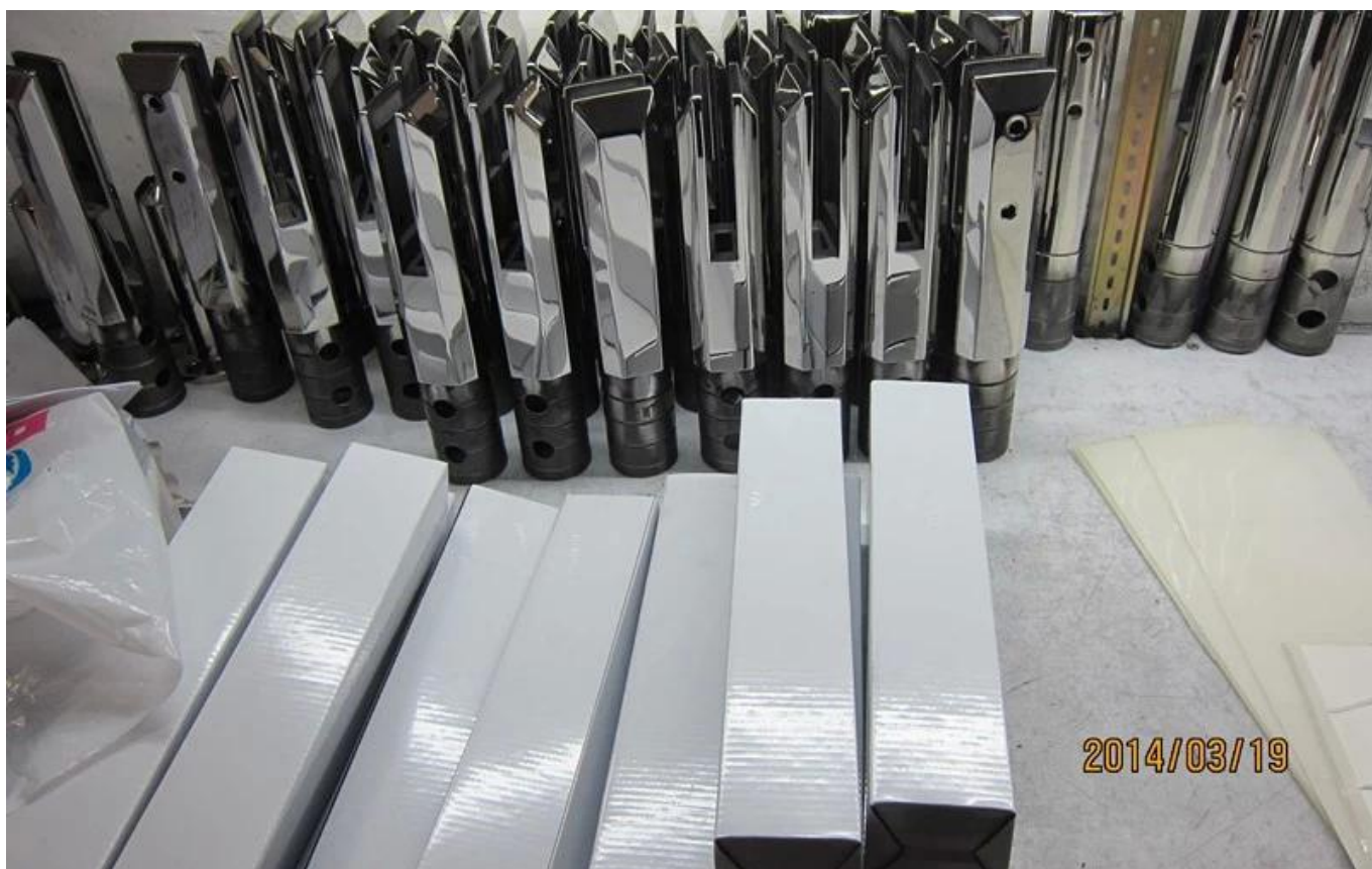
Related glass pool fencing hardwares- Glass hinge & glass latch .