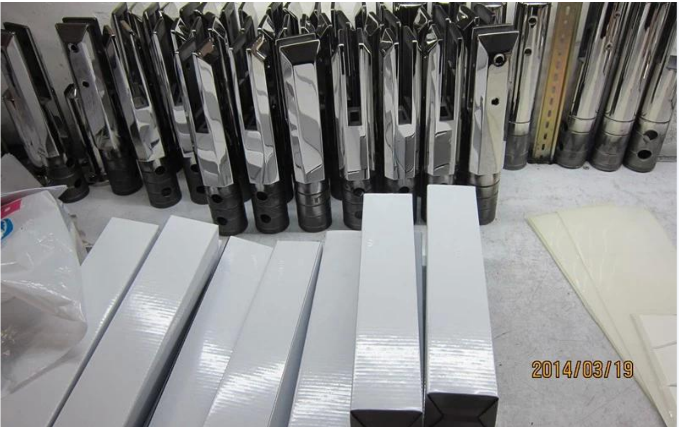
Related glass pool fencing hardwares- Glass hinge & glass latch .