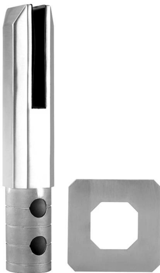
Round core drill glass spigot , model # RCM-