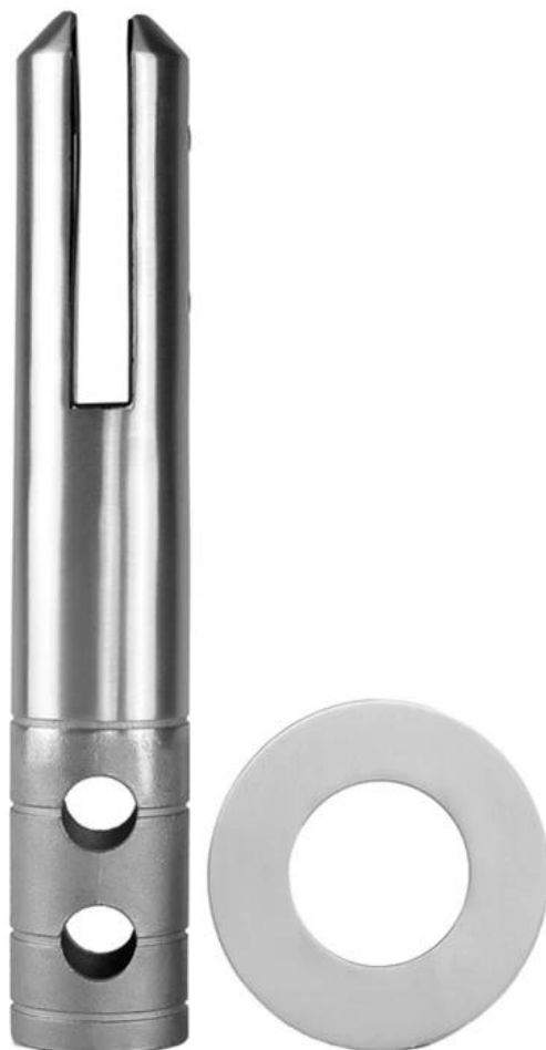
Fascia mount glass spigot-