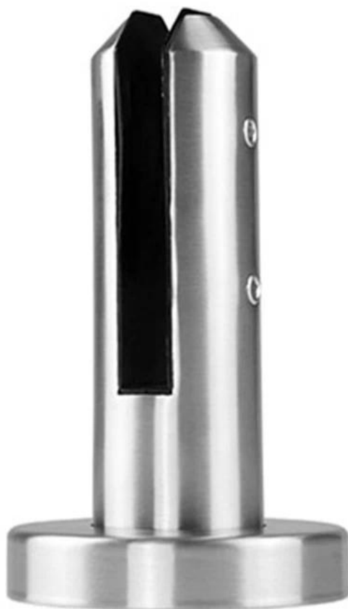
SQUARE core drill glass spigot , model #SCM-