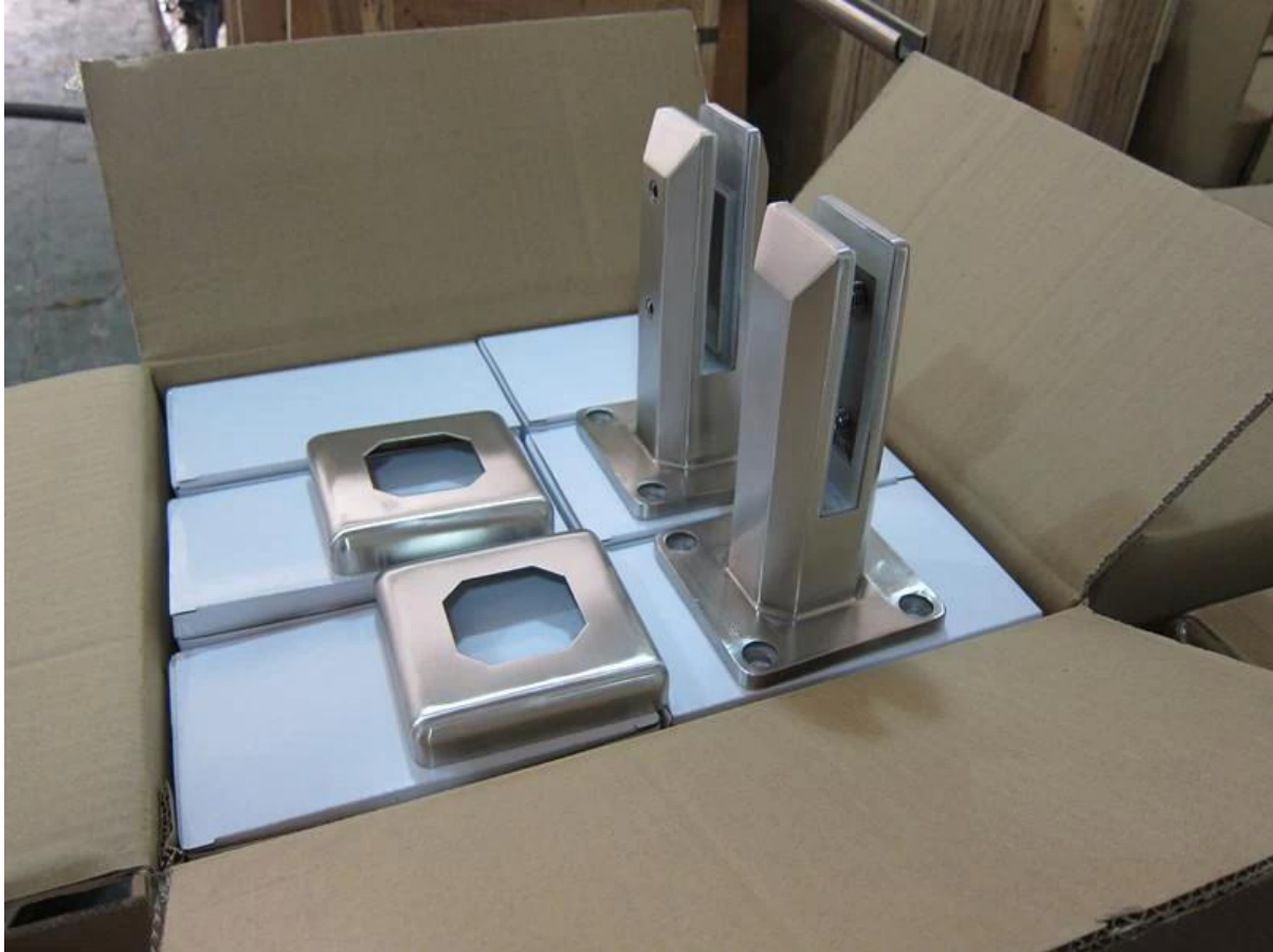
Project photos: SBM in Mirror finish: