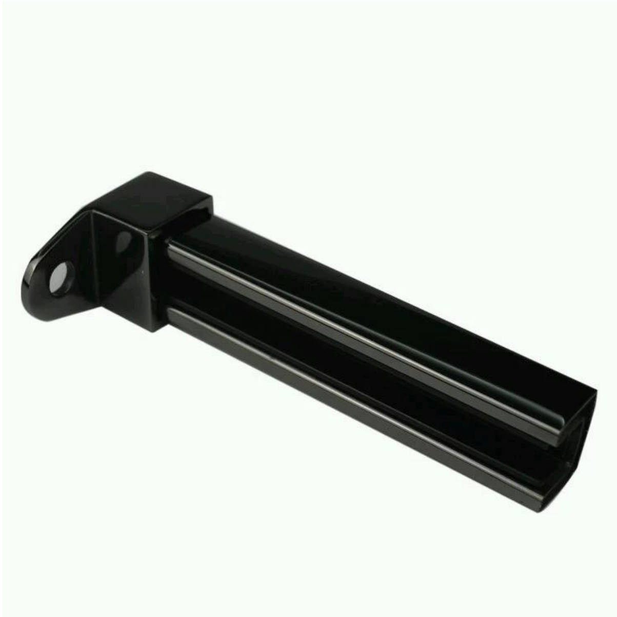
Mirror Polished & Brushed finished 25mm x 21mm square cap rail ,