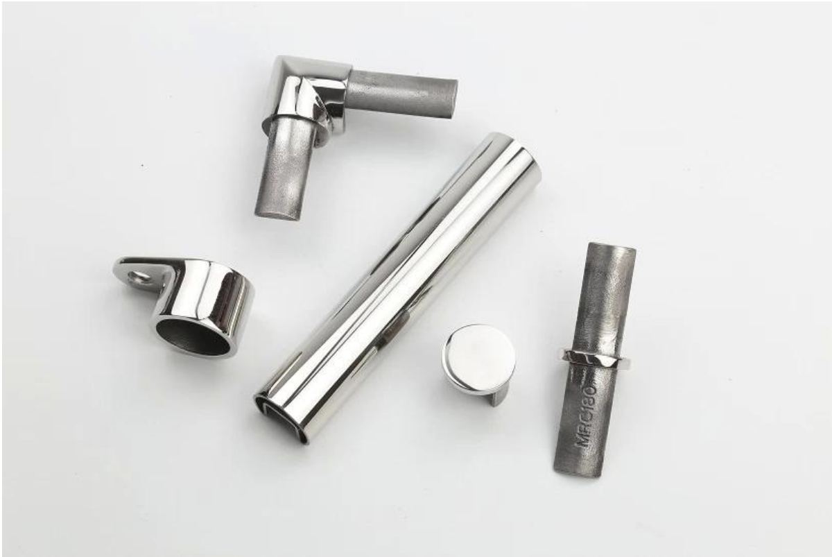
Project photos with 21*25*1.2mm cap rails-