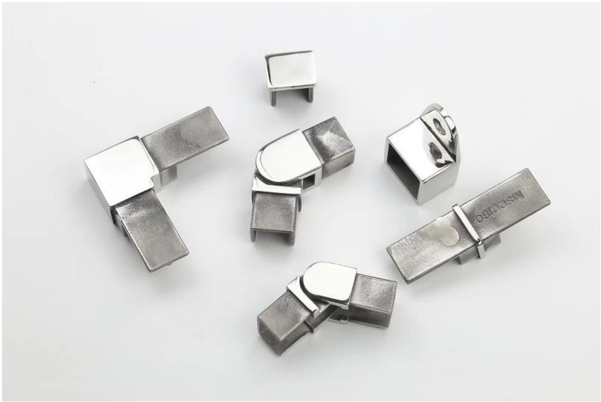
Diameter 25.4*1.2mm cap rail -