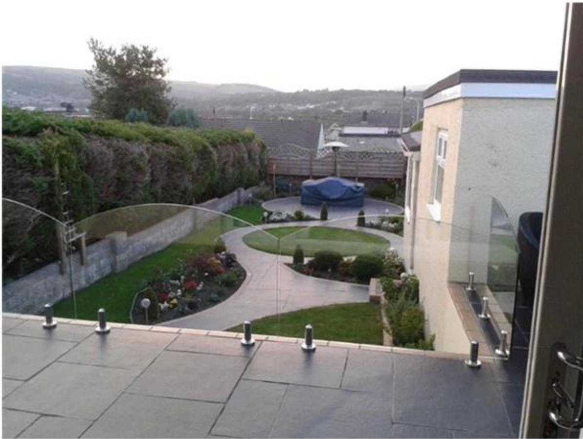
glass balustrade system