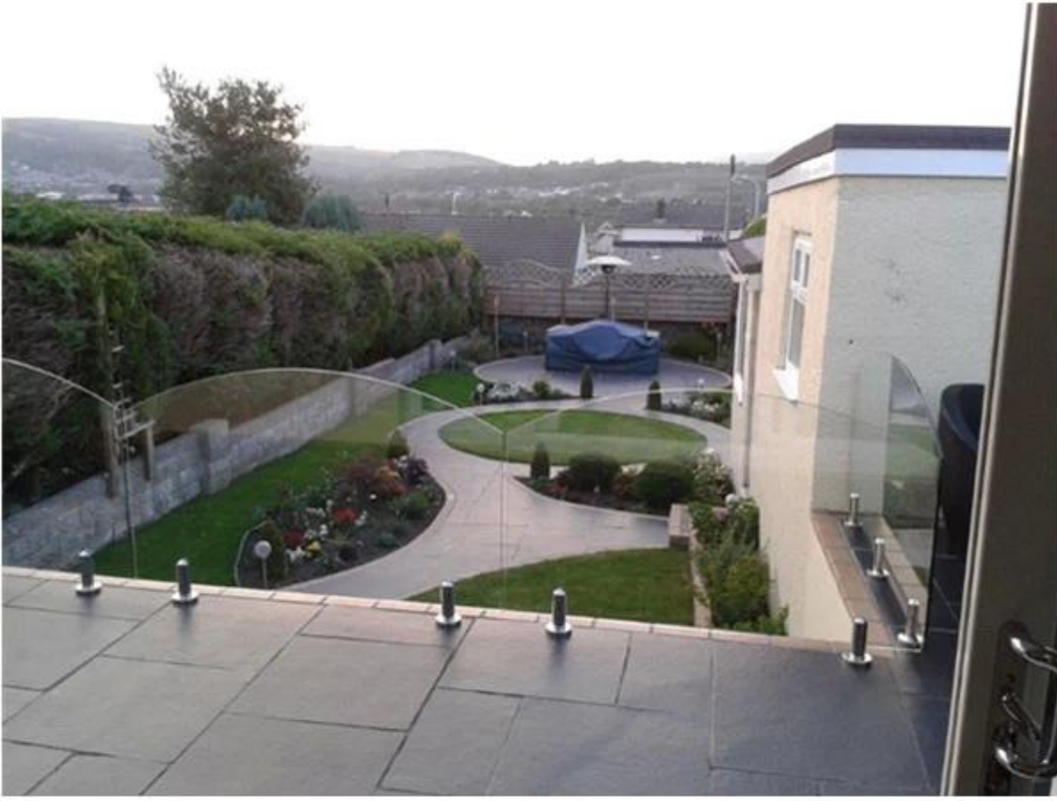
glass balustrade system