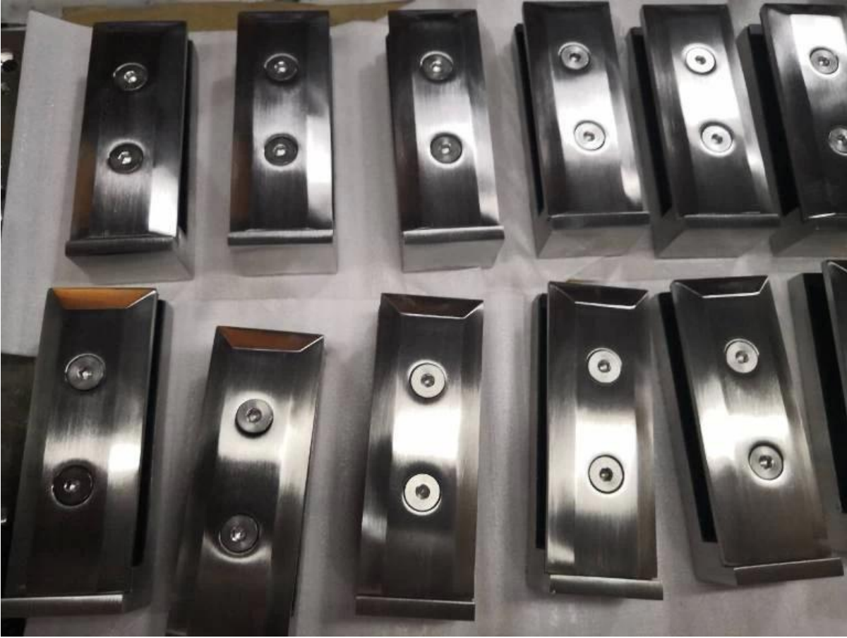
2) Side mounted glass spigot size