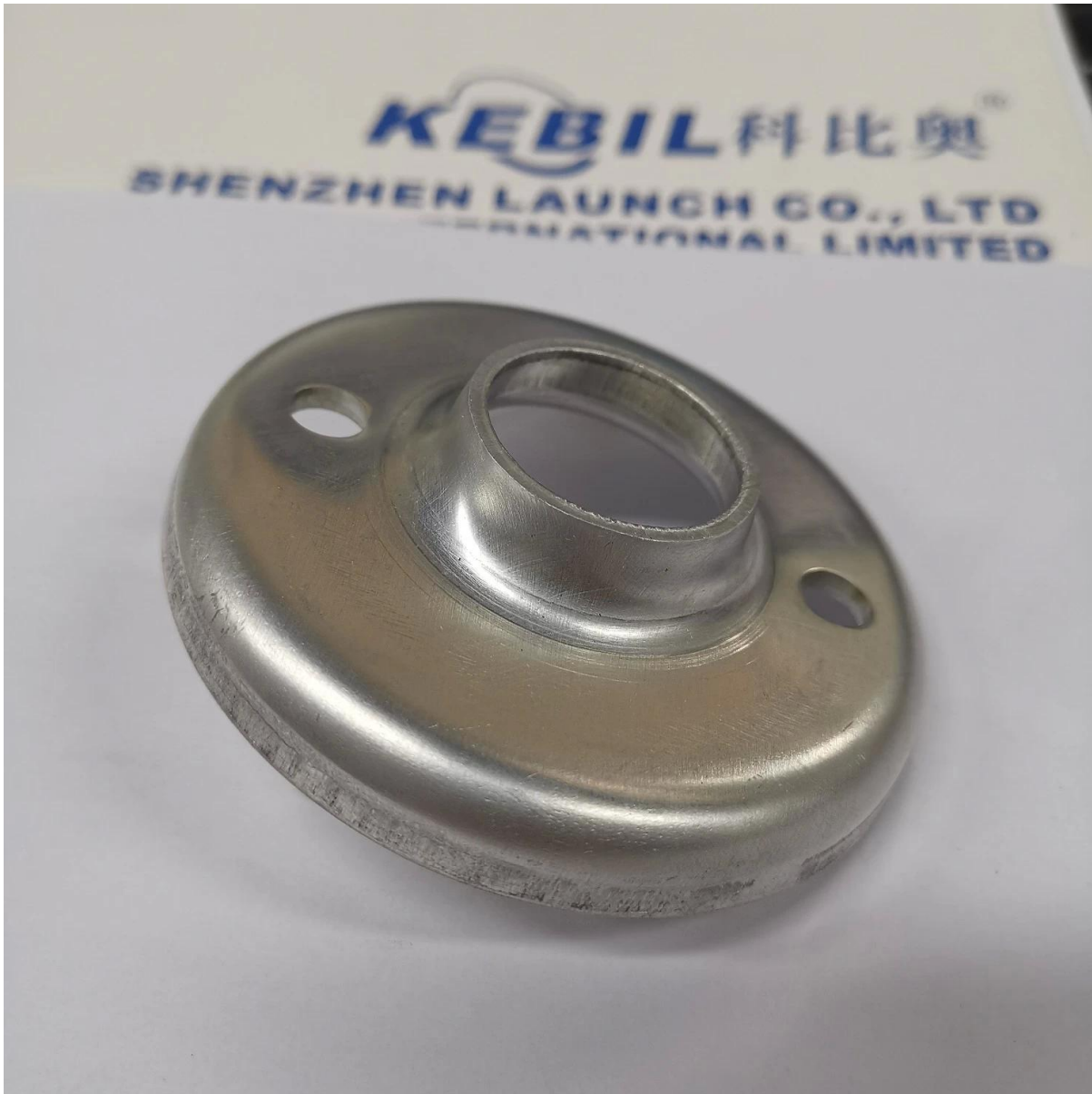
Stamping custom OEM replacement parts