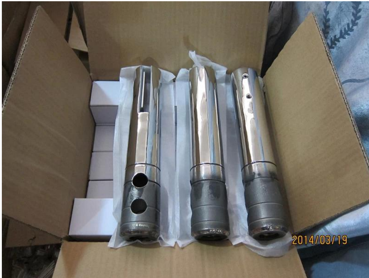
Glass spigot related accessories: Glass hinge and latch: