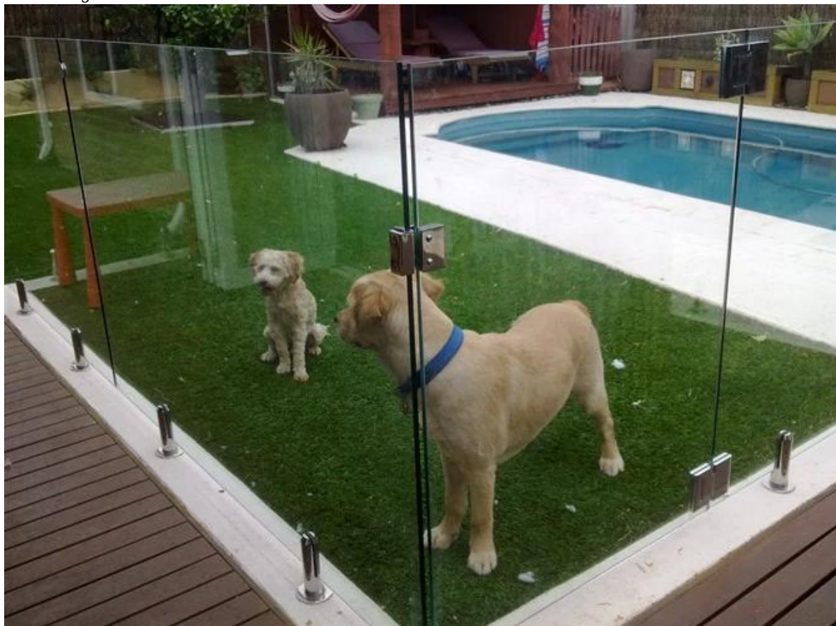
Here is one of our customer send back project picture: