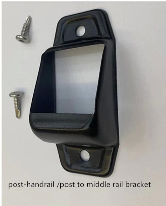
post-handrail /post to middle rail bracket