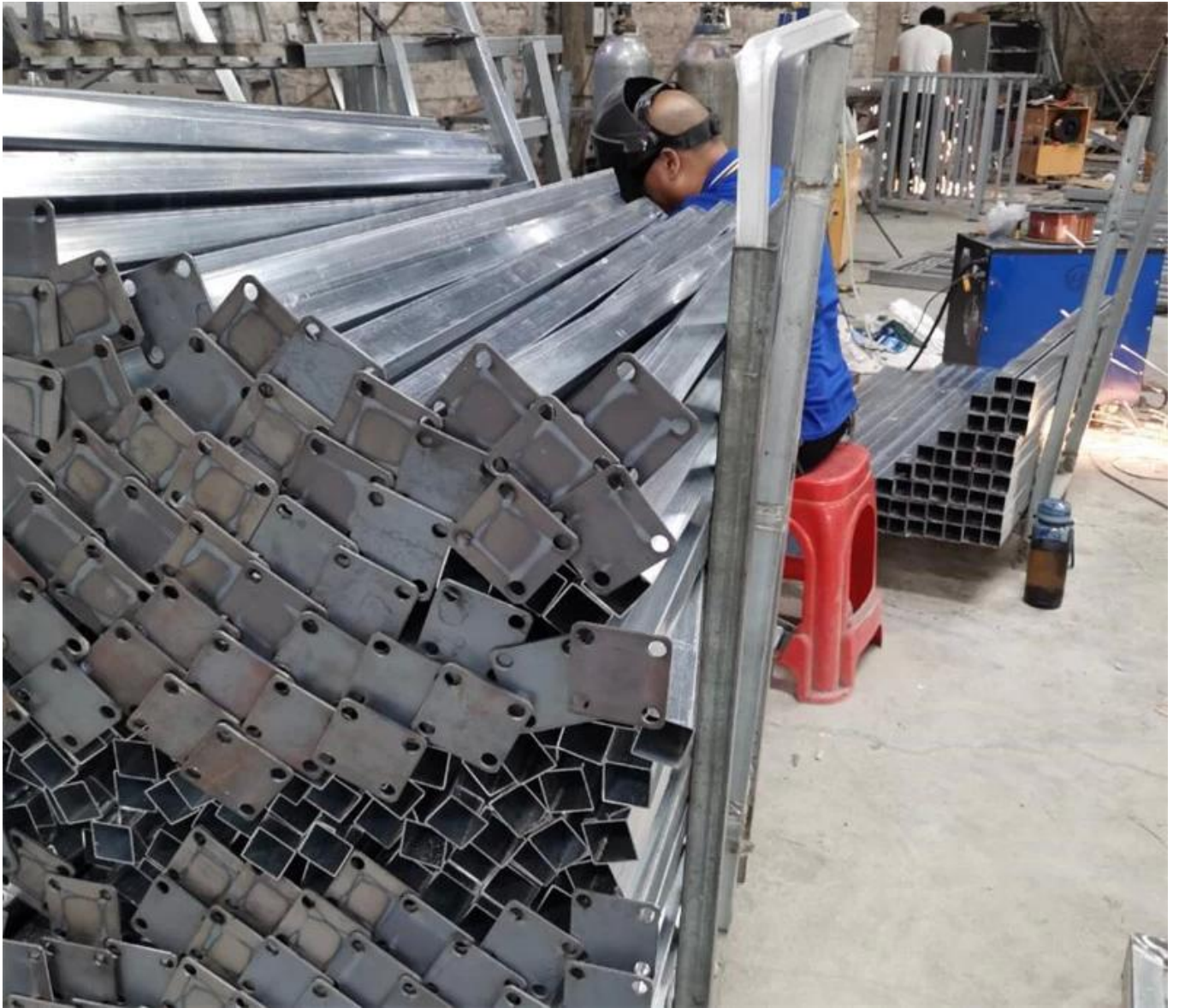
# Project photos of steel railings -