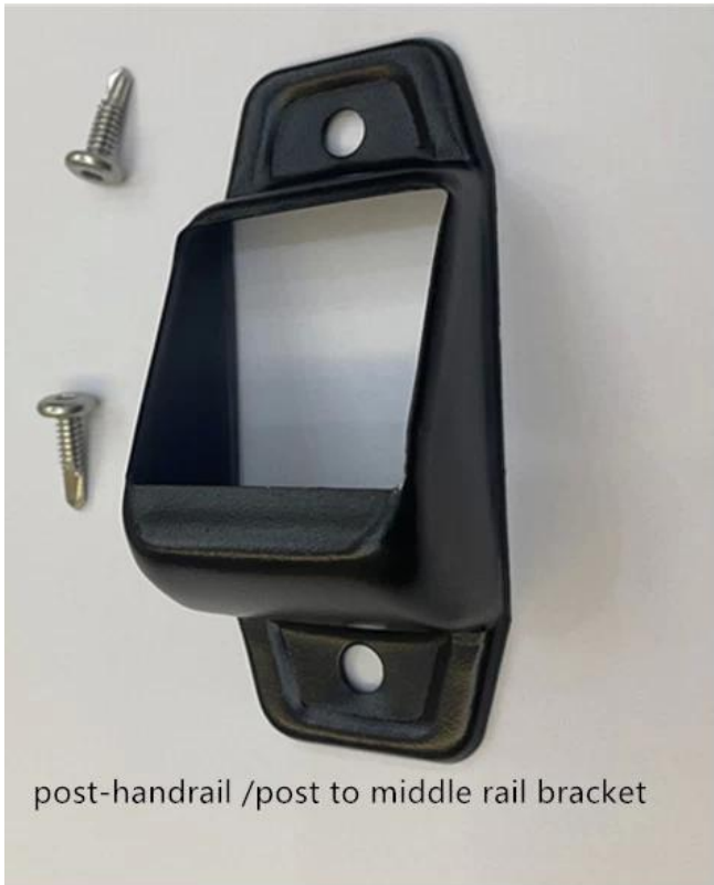
post-handrail /post to middle rail bracket