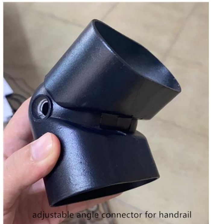
adjustable angle connector for handrail