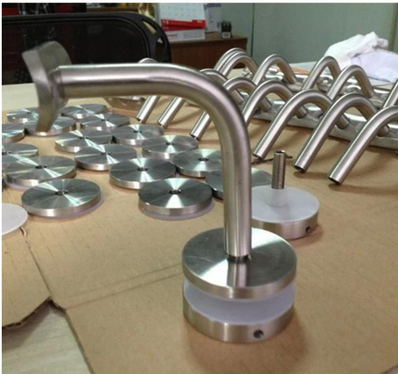
More models of Glass mount handrail bracket holder -