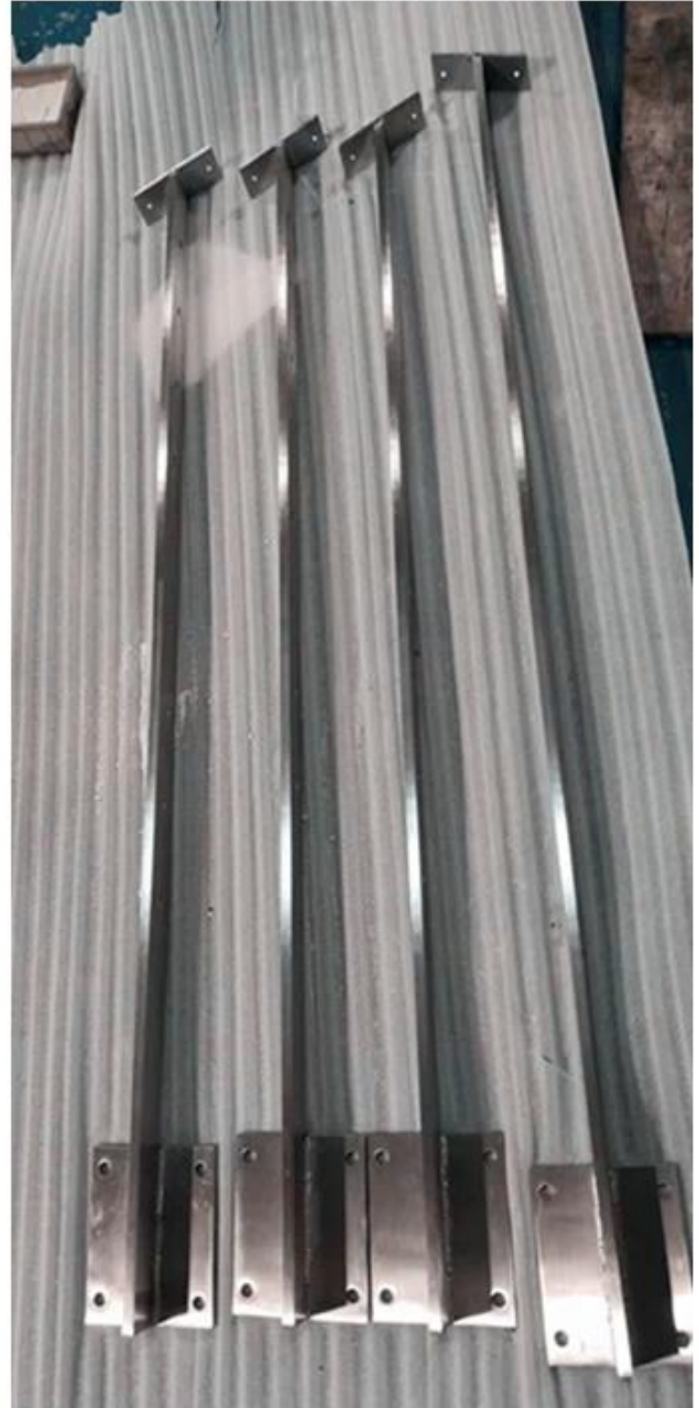
Double flat bar type stainless steel railing designs: