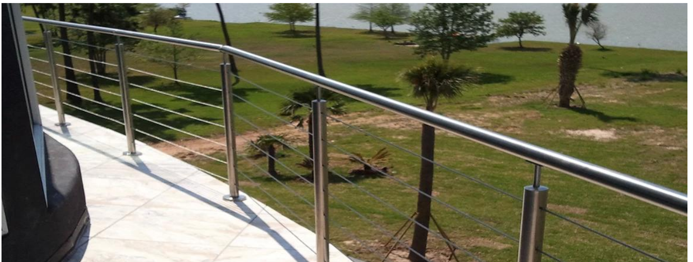
Stainless Steel 304/316 Cable Railing for commercial buildings, home residential, ect.