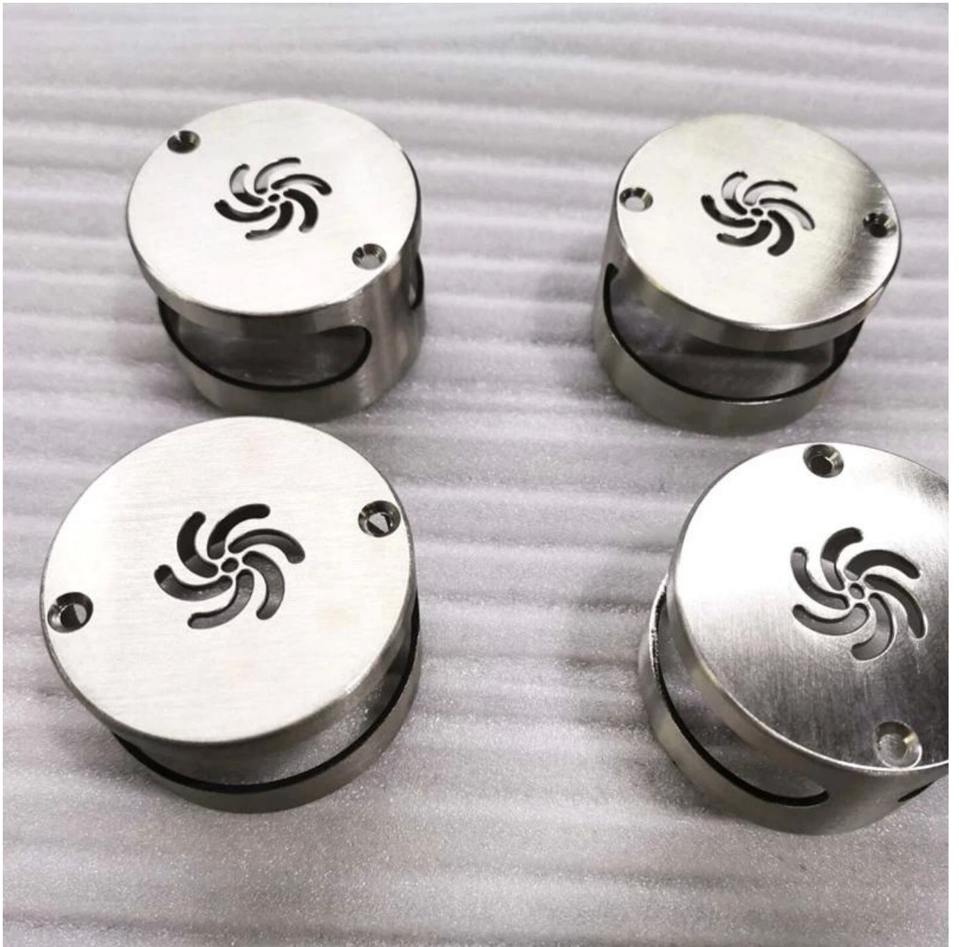
CNC machined part for electronic use (head phone ear cup)