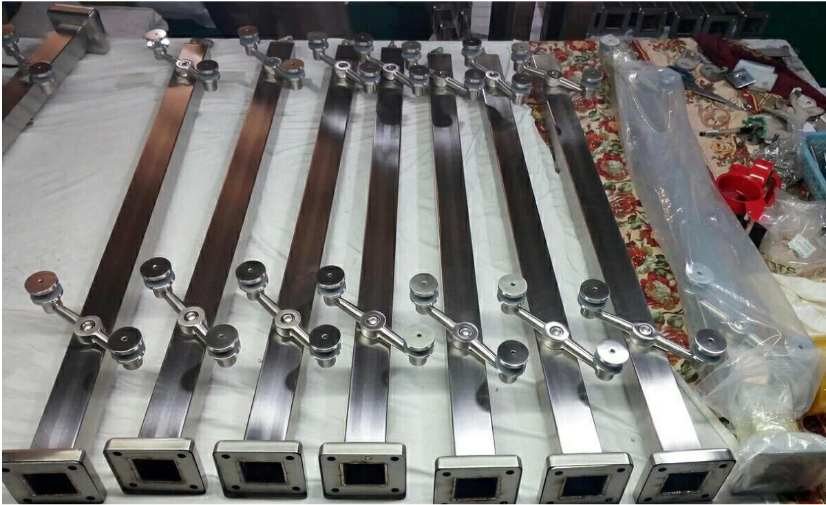
6. Stainless Steel Short witt side plate design :