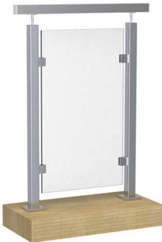
4. Stainless Steel Short Standoff Post & Handrail design :