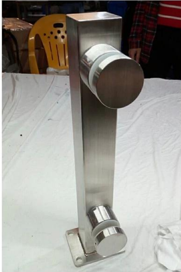
5. Stainless Steel Standoff Post & Handrail design :