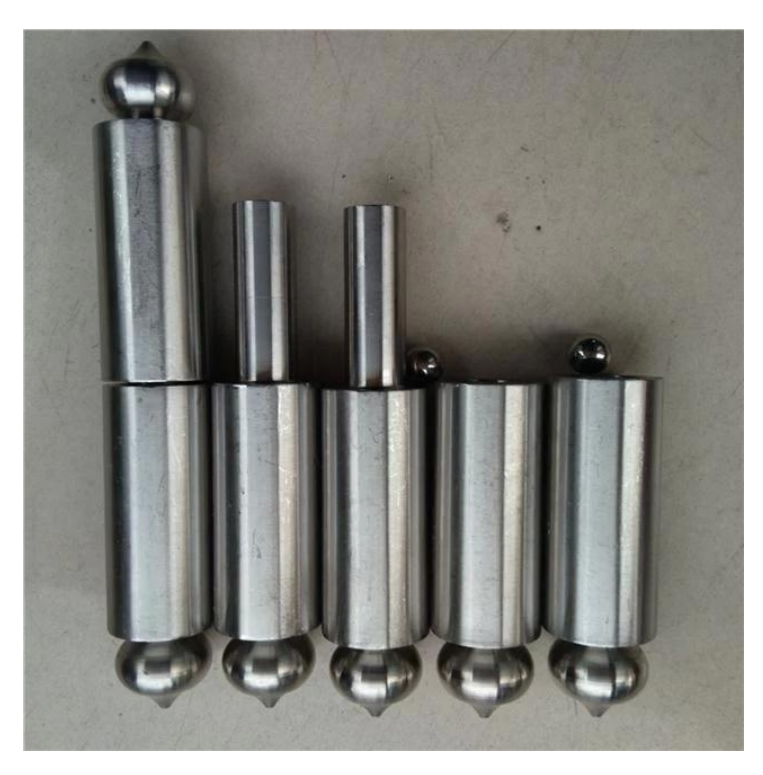
STAINLESS STEEL WELD ON HINGE(ALL BODY SS304 OR SS316)

Material: Stainless steel body with stainless steel fixed pin and stainless steel washer; SS304 or SS316 optional.