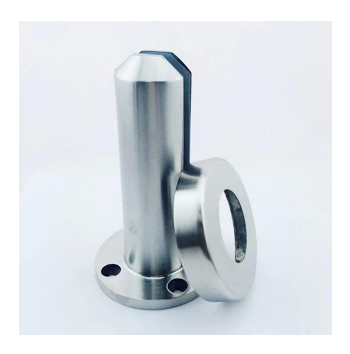
Model No.: RCM-2(round core drill spigot)