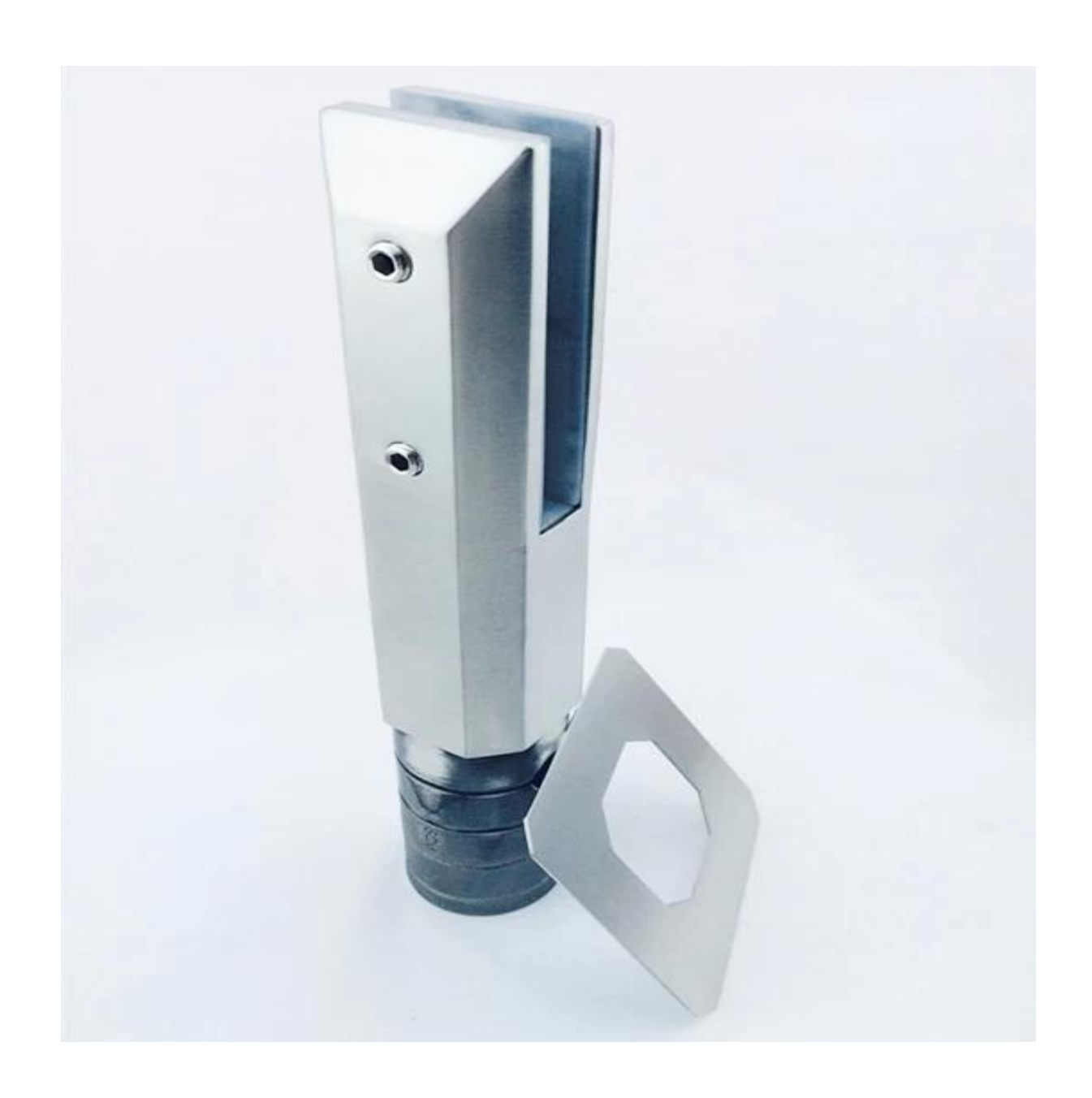
Model No.: RBM-2(round base plate spigot)