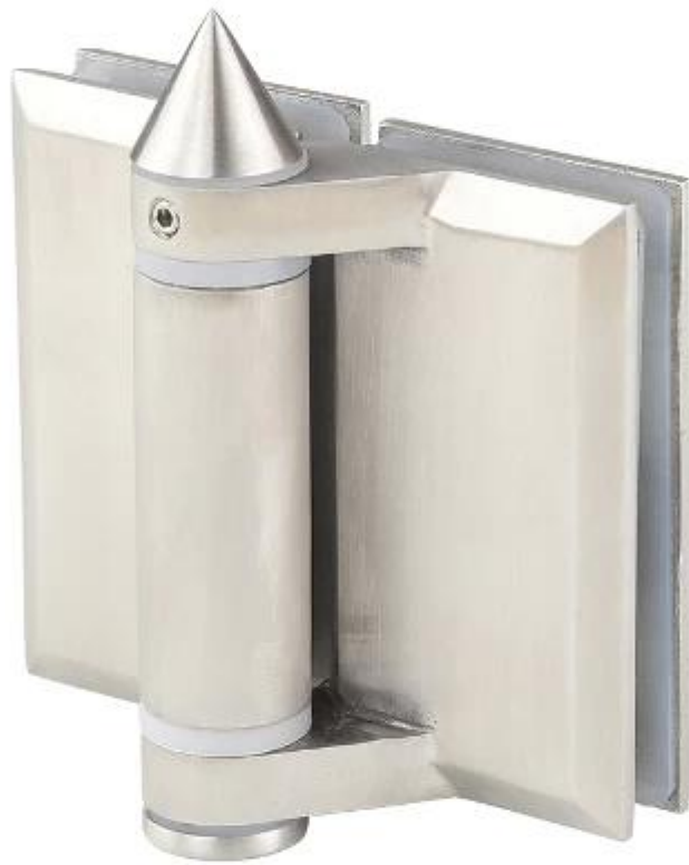
Model No. G-W2, glass to square post / wall hinge