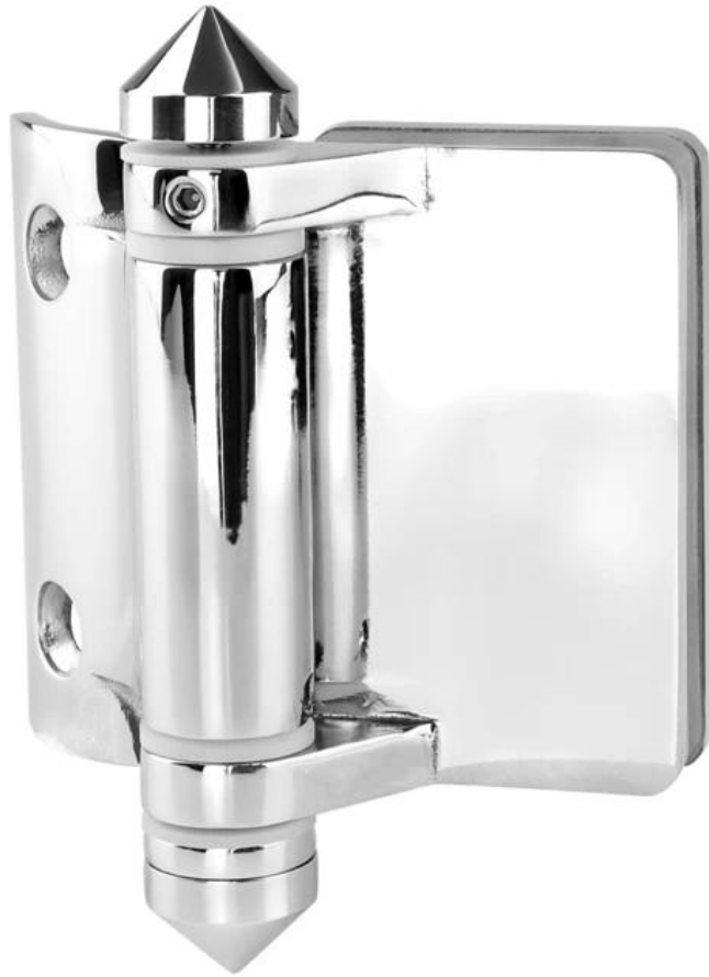
pool fencing spring loaded stainless steel 316 glass door hinge installed