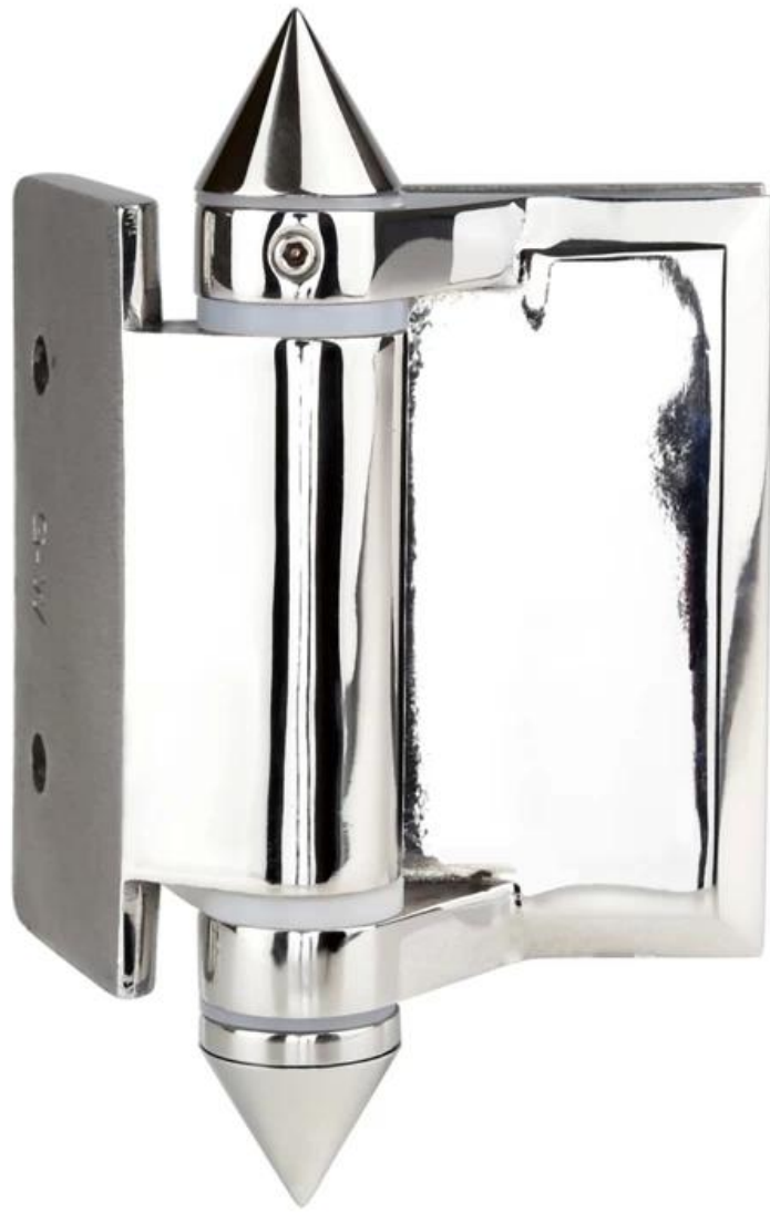
Model No. G-R, glass to square post / wall hinge