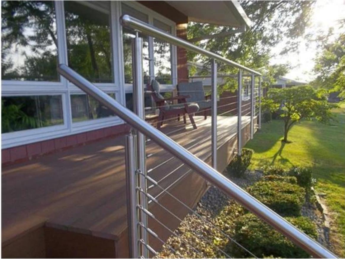
wire rope railing system