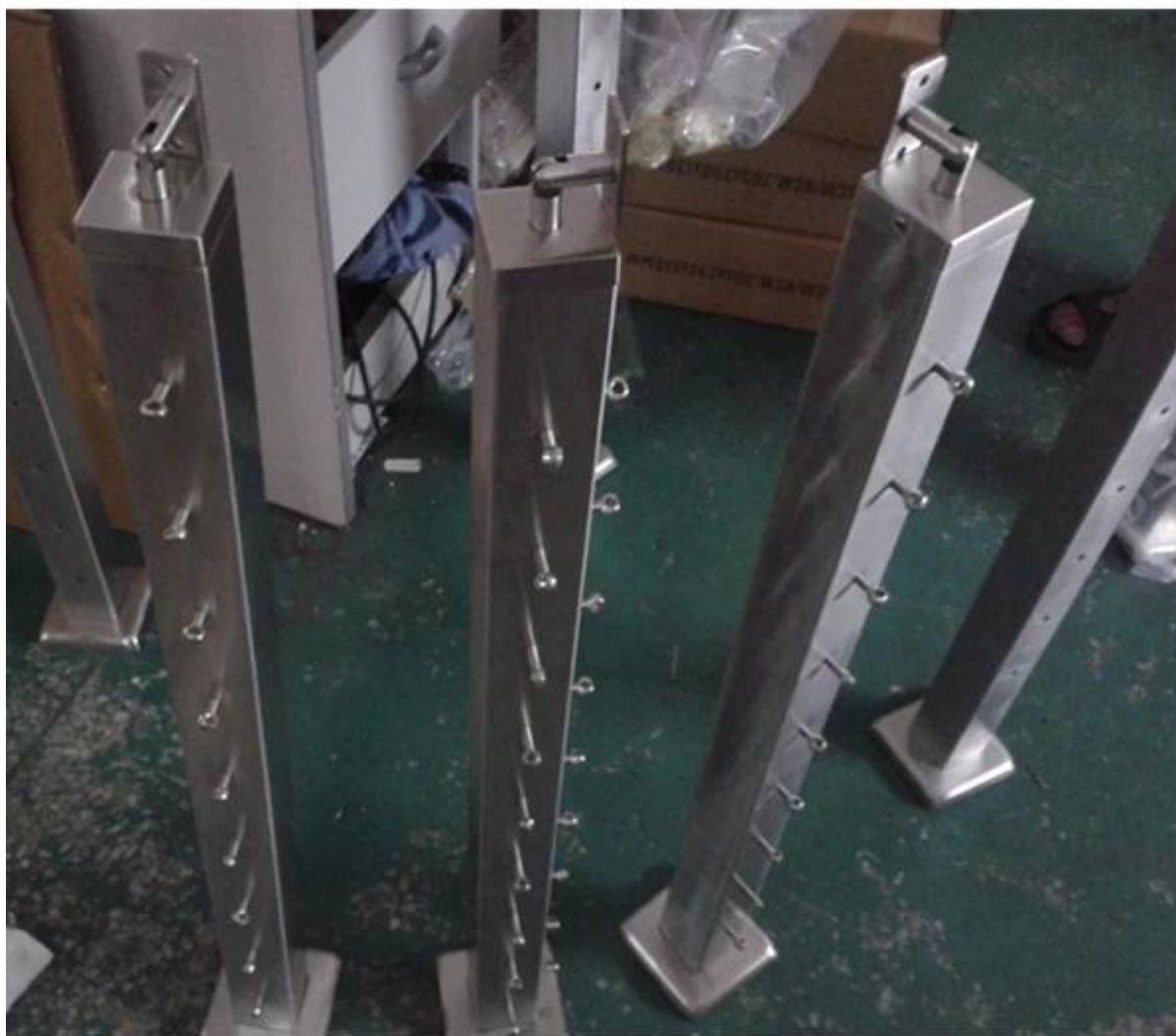
3. with stainless steel top rail and wooden handrail