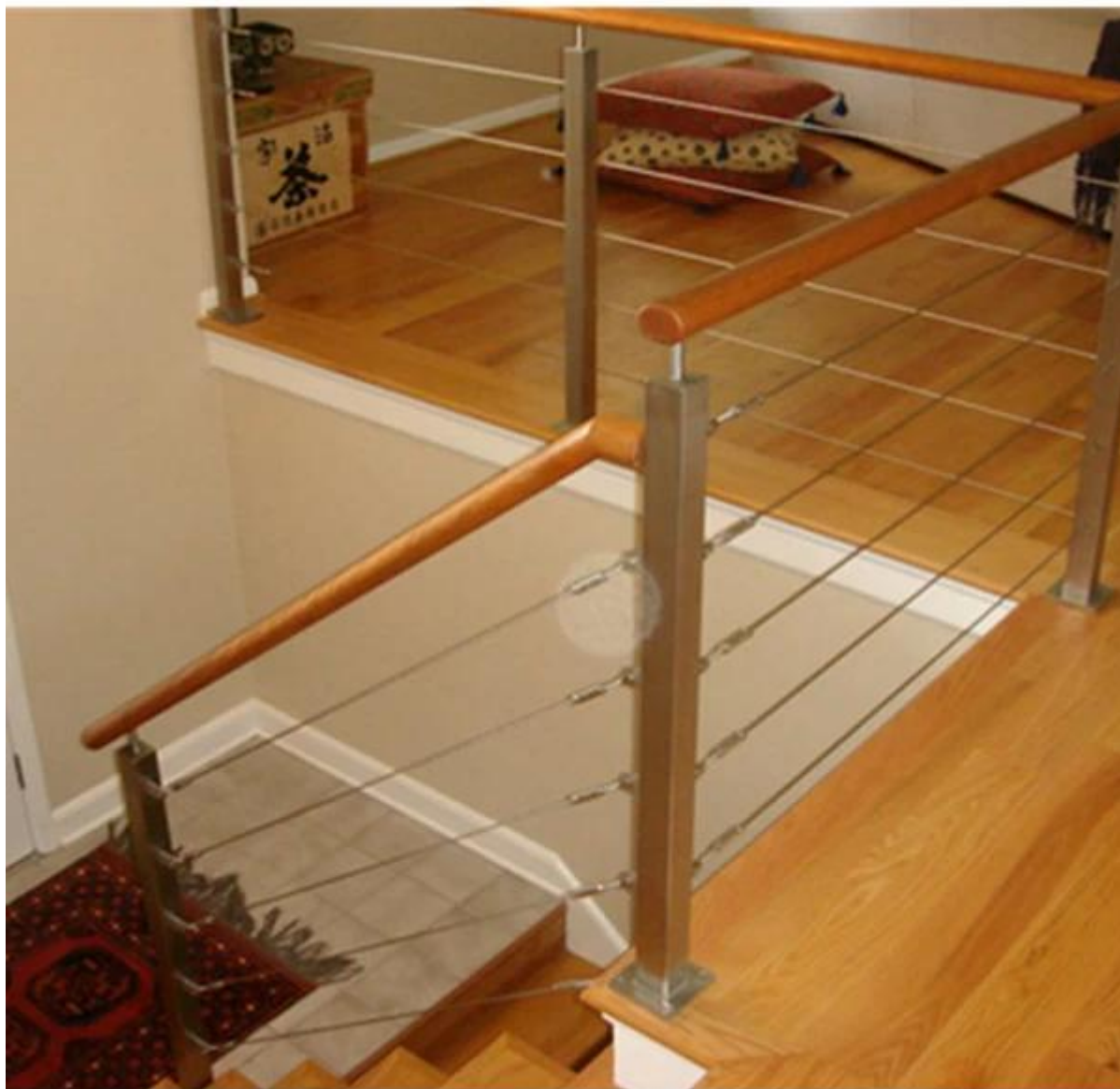
4. used for balcony stair and balcony