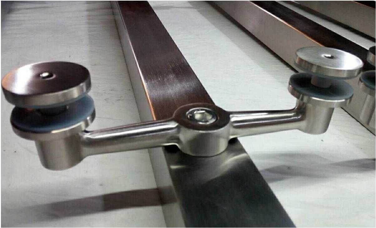
Adjustable spider standoff