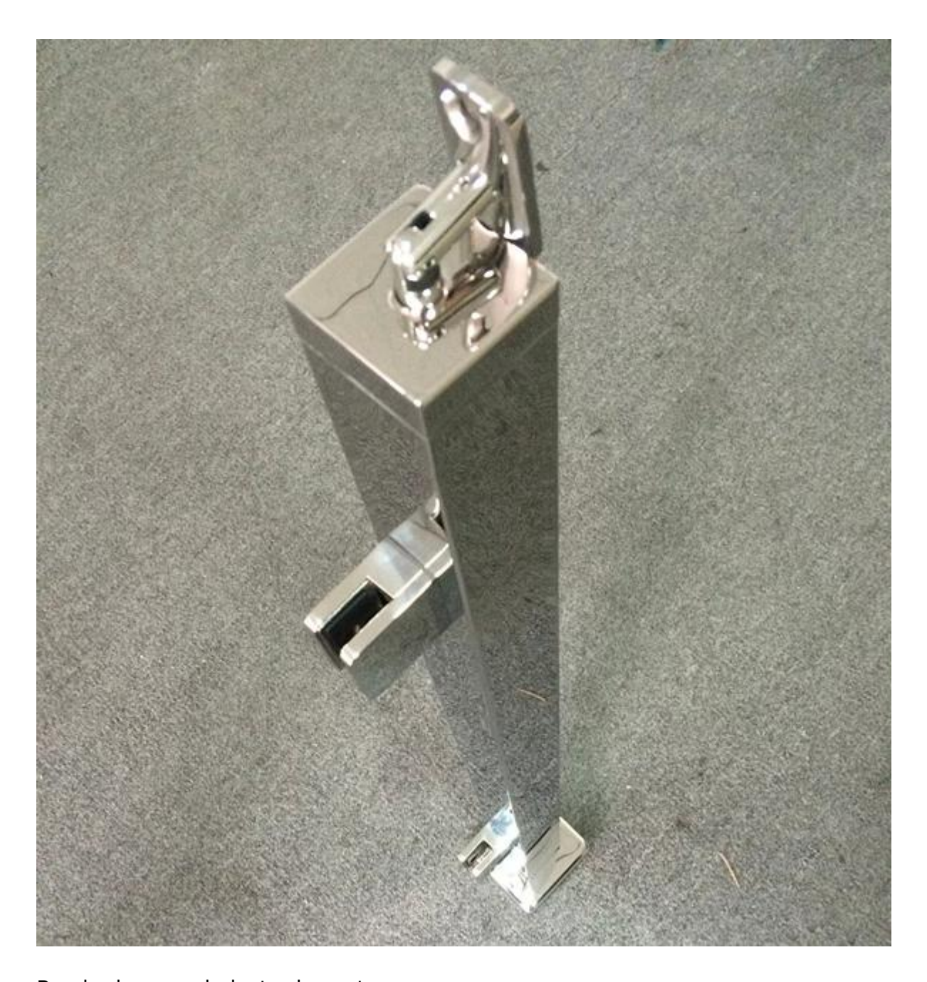
Brushed square balustrade post