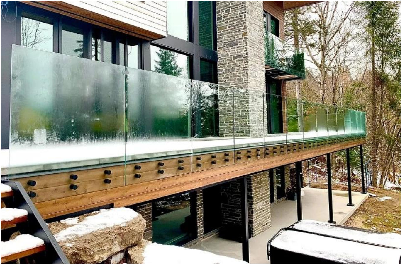
Other models of glass standoffs as below-