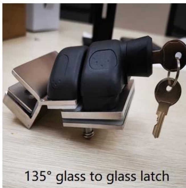
135° glass to glass latch