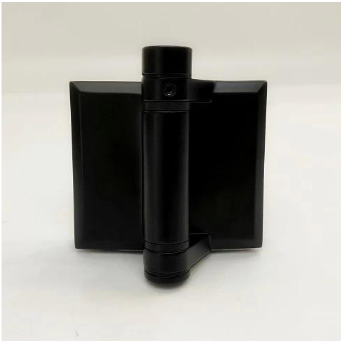
Satin brushed finish