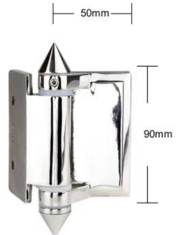
Part # G-W