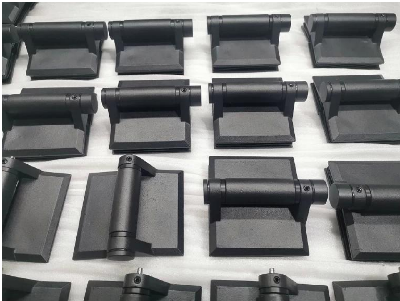
More designs: Glass to round post hinge & glass to square post or wall hinge