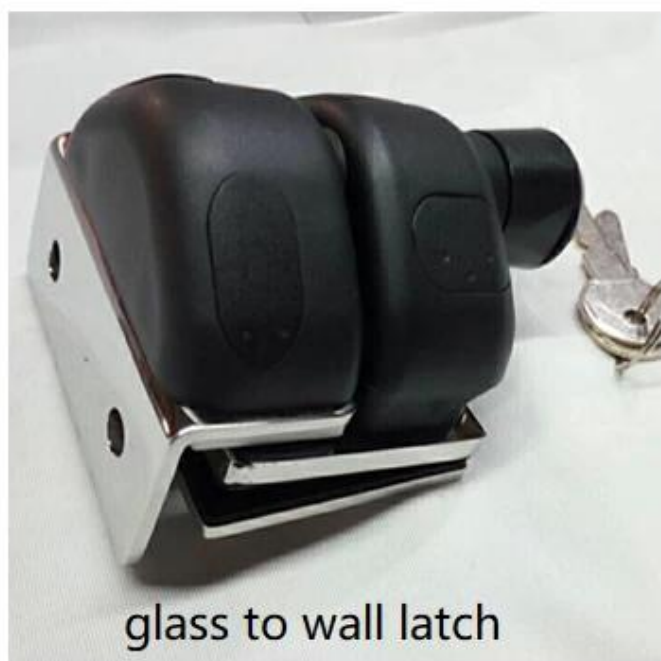
glass to wall latch