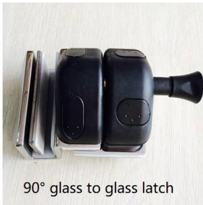
90° glass to glass latch