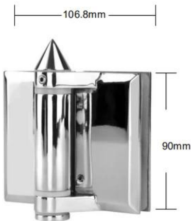
Part # G-G

Spring can be adjusted for closing speed control .