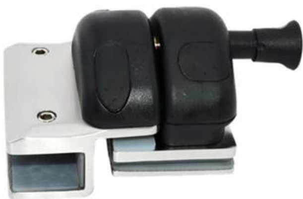
180° glass to glass latch