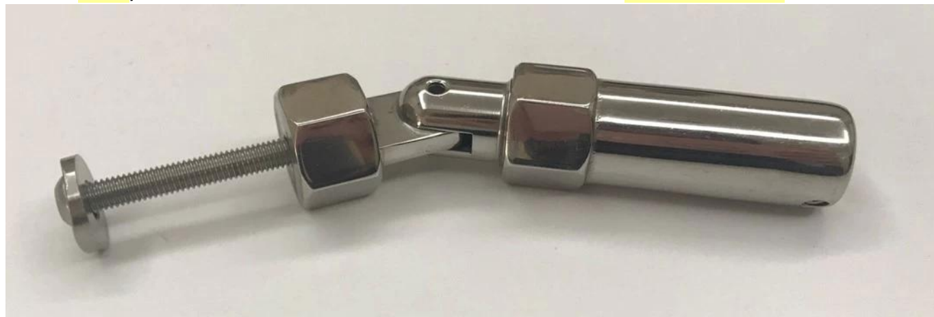
Model T807A , stainless steel cable tensioner for diameter 3mm cable: