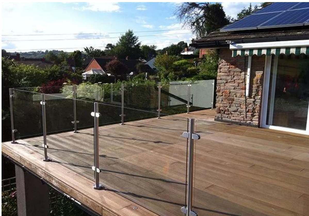
End cap required balustrade post kit for swimming pool fence