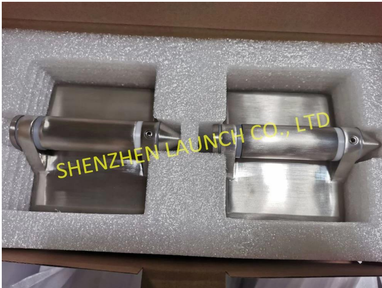
Glass to glass post hinge, with flat cap on the ends