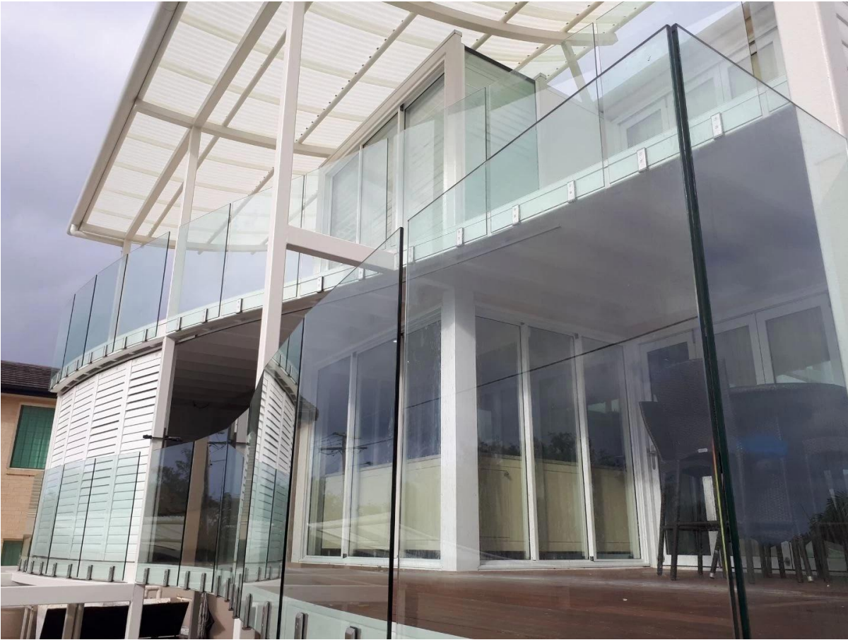
Fascia mount frameless windscreen glass spigot clamp Safety Packaging