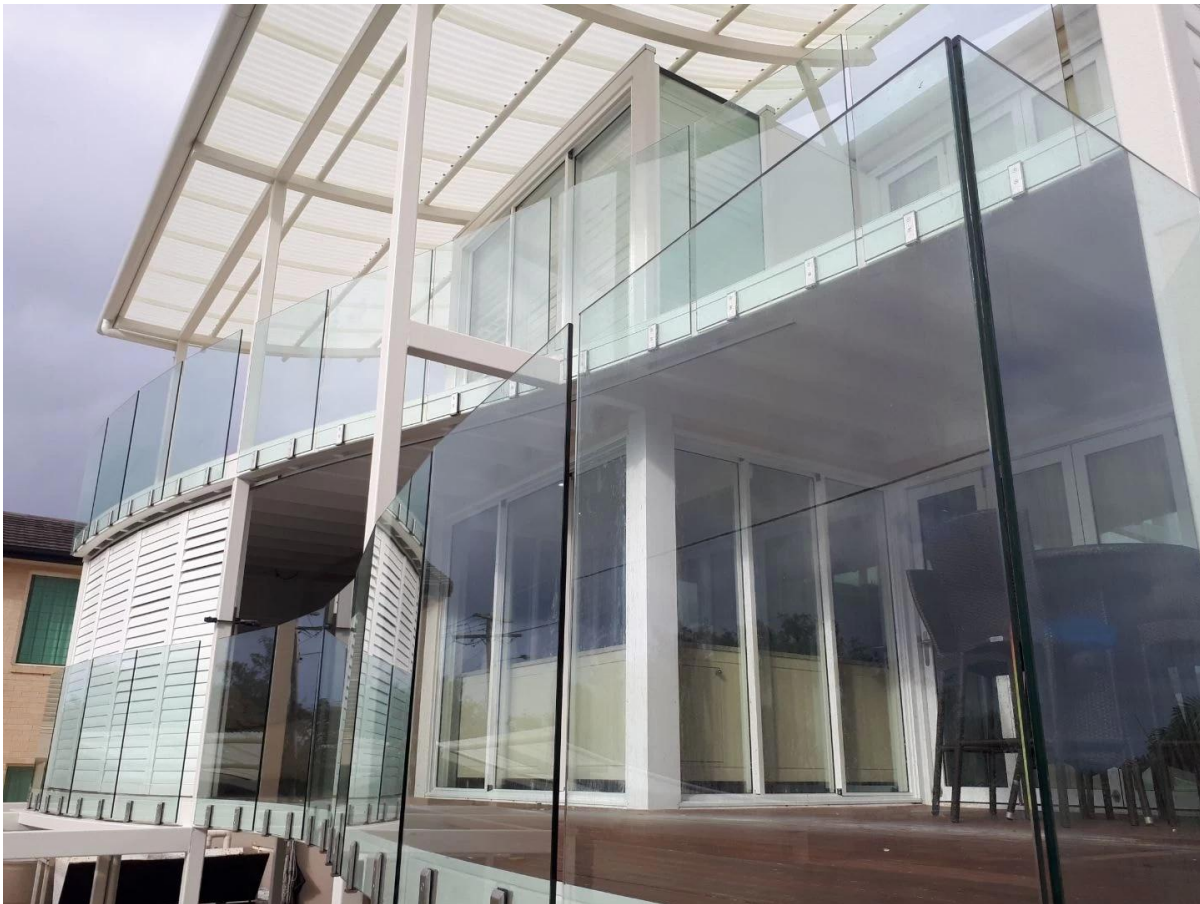
Fascia mount frameless windscreen glass spigot clamp Safety Packaging