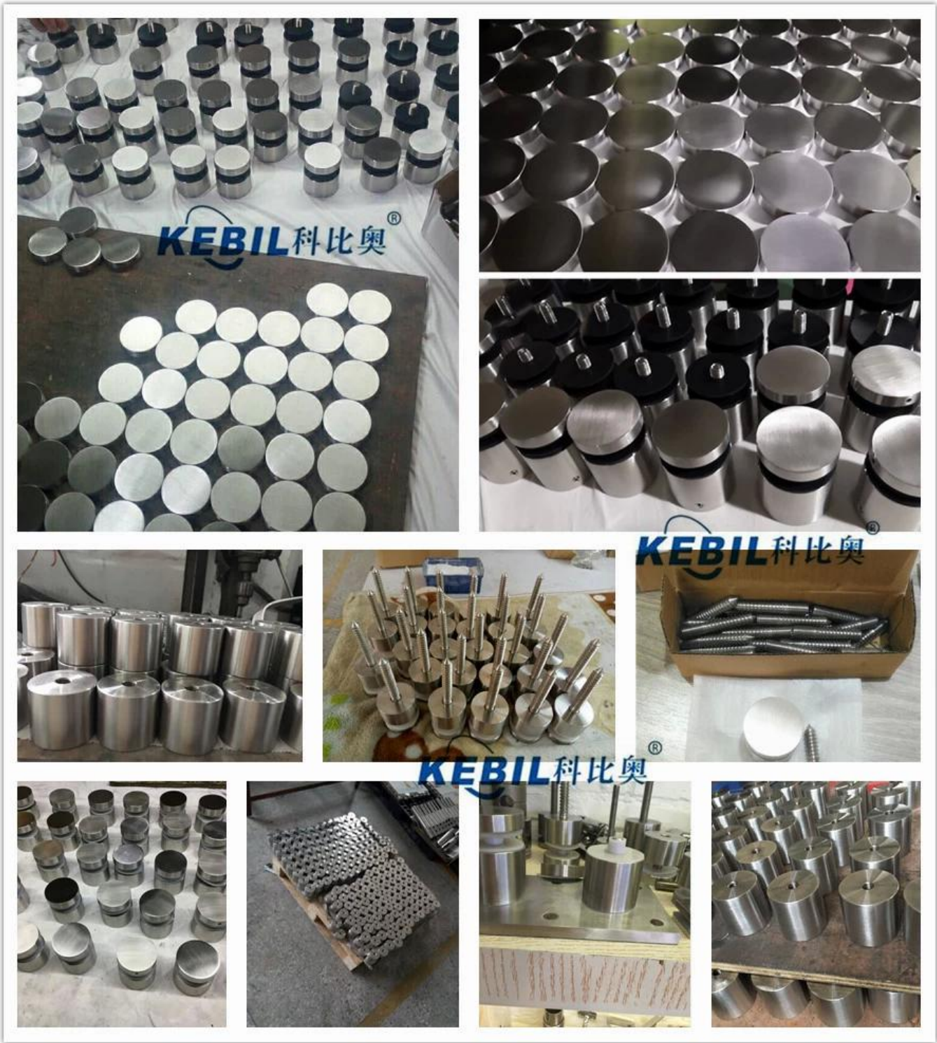
Stainless Steel Glass Standoff Railing Project: