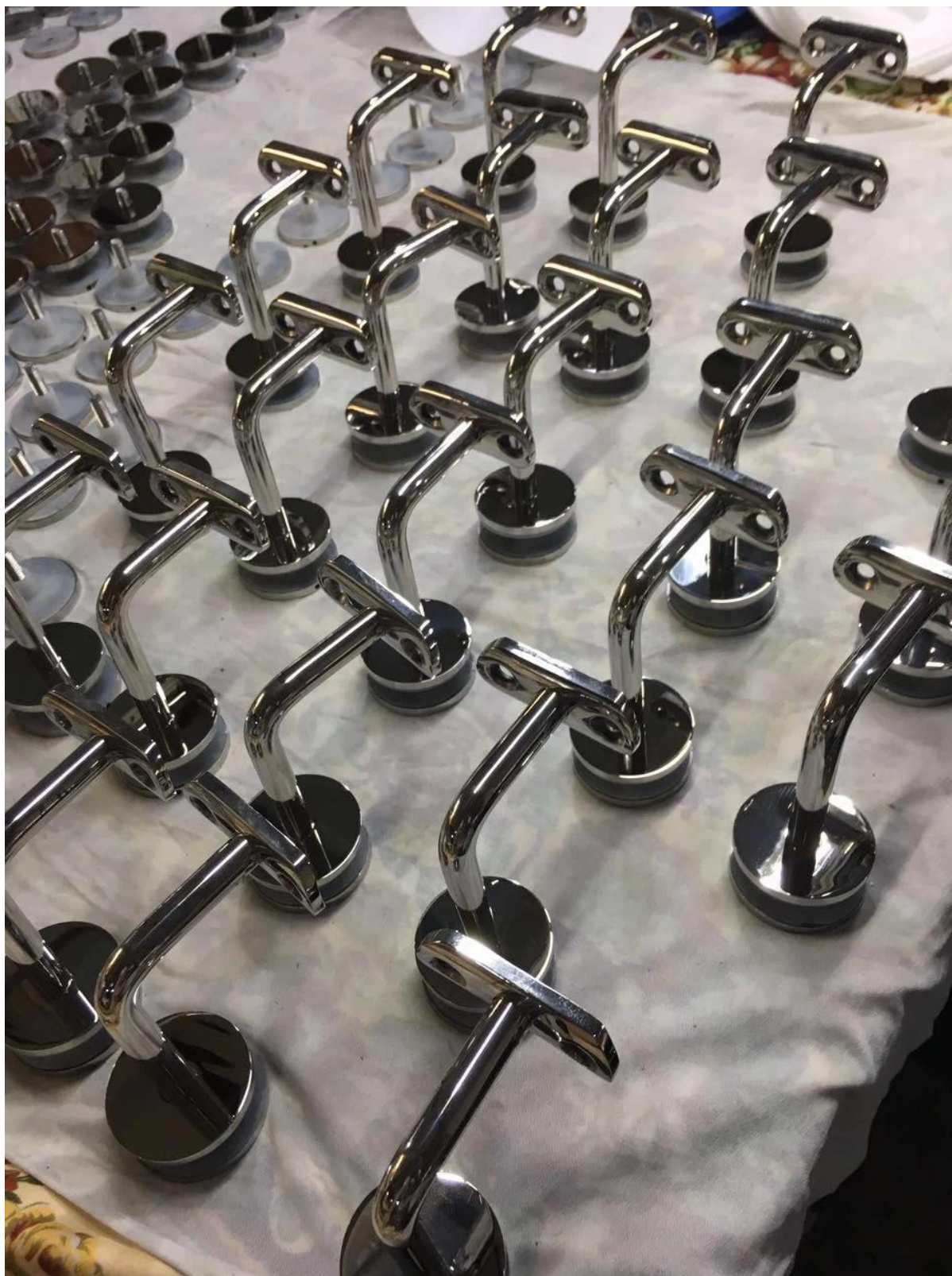
Project Handrail brackets for indoor use