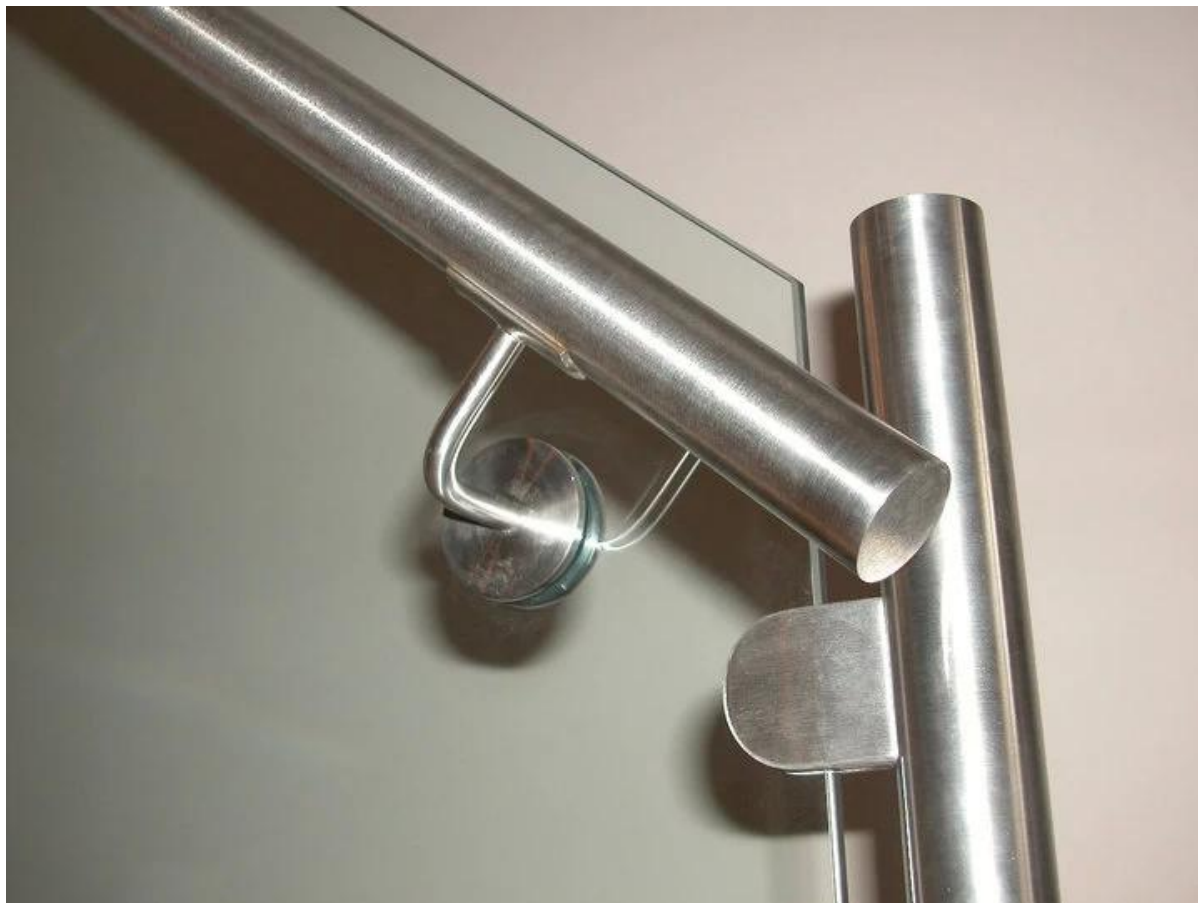
Handrail brackets for outdoor use