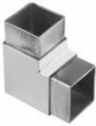
2-way tube connector

For tube dimensions Model 40×20×1.5(mm) S400 40×40×1.5(mm) S401 50×50×1.5(mm) S501 51×51×3.2(mm) S511 50×50×3.0(mm) S511A