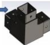
4-way tube connector

For tube dimensions Model 30×30×1.5(mm) S303 40×40×1.5(mm) S403 50×50×2.0(mm) S503 51×51×3.2(mm) S513 50×50×3.0(mm) S513A