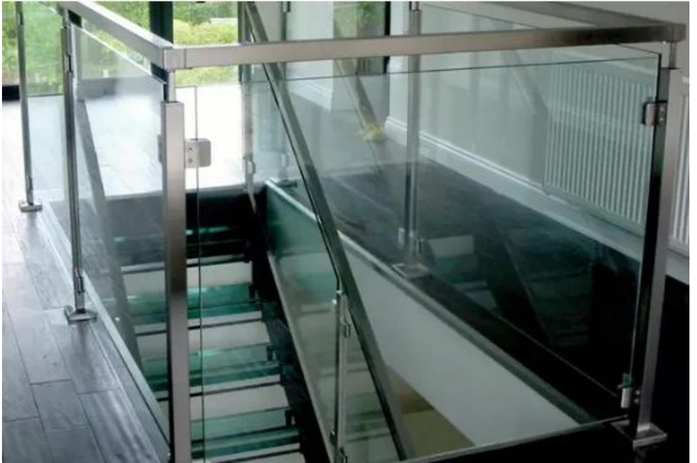
Round Type Stainless Steel Pipe Corner Connector / Pipe Elbow: