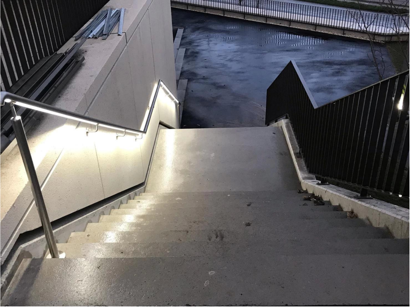
Handrail Slot Tubes: