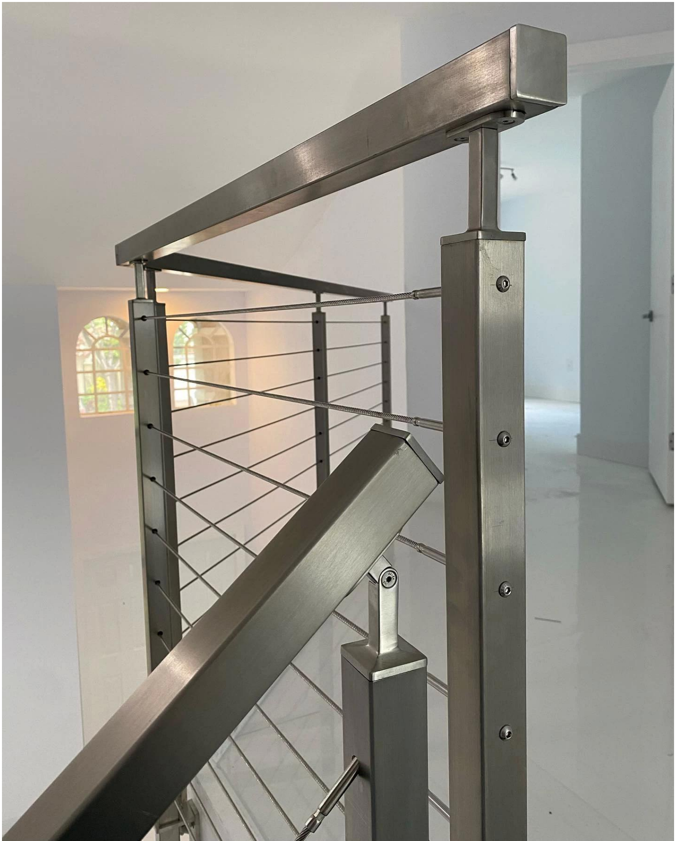
Cable Infilled Stainless Steel Balustrade Post with Stainless Steel Handrail for Model Stair Railing Design