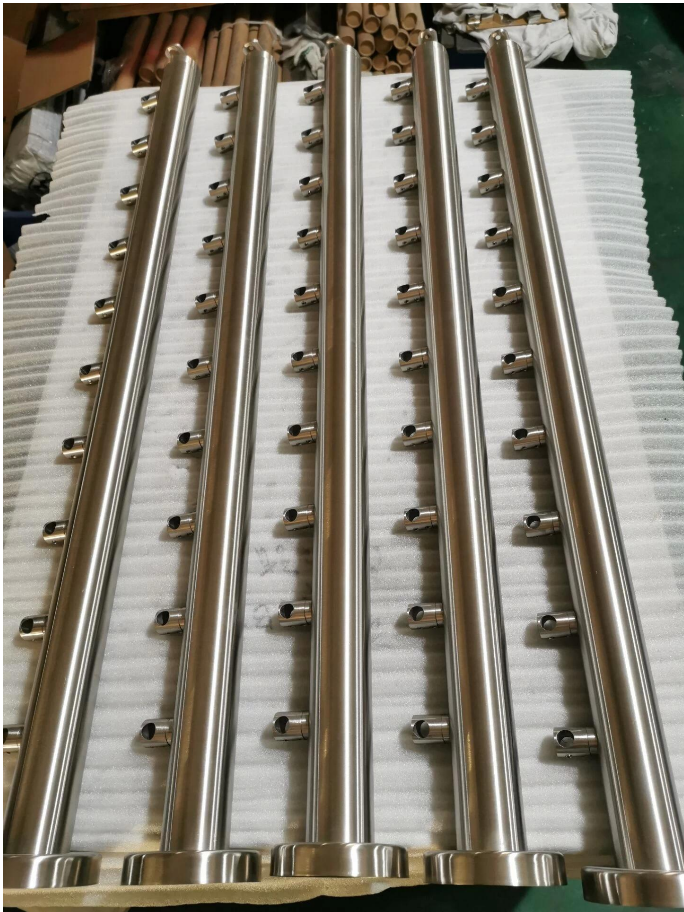
3. Specs. for Stainless Steel Hand Railing Pipe Bar Adapter Crossbar Holder