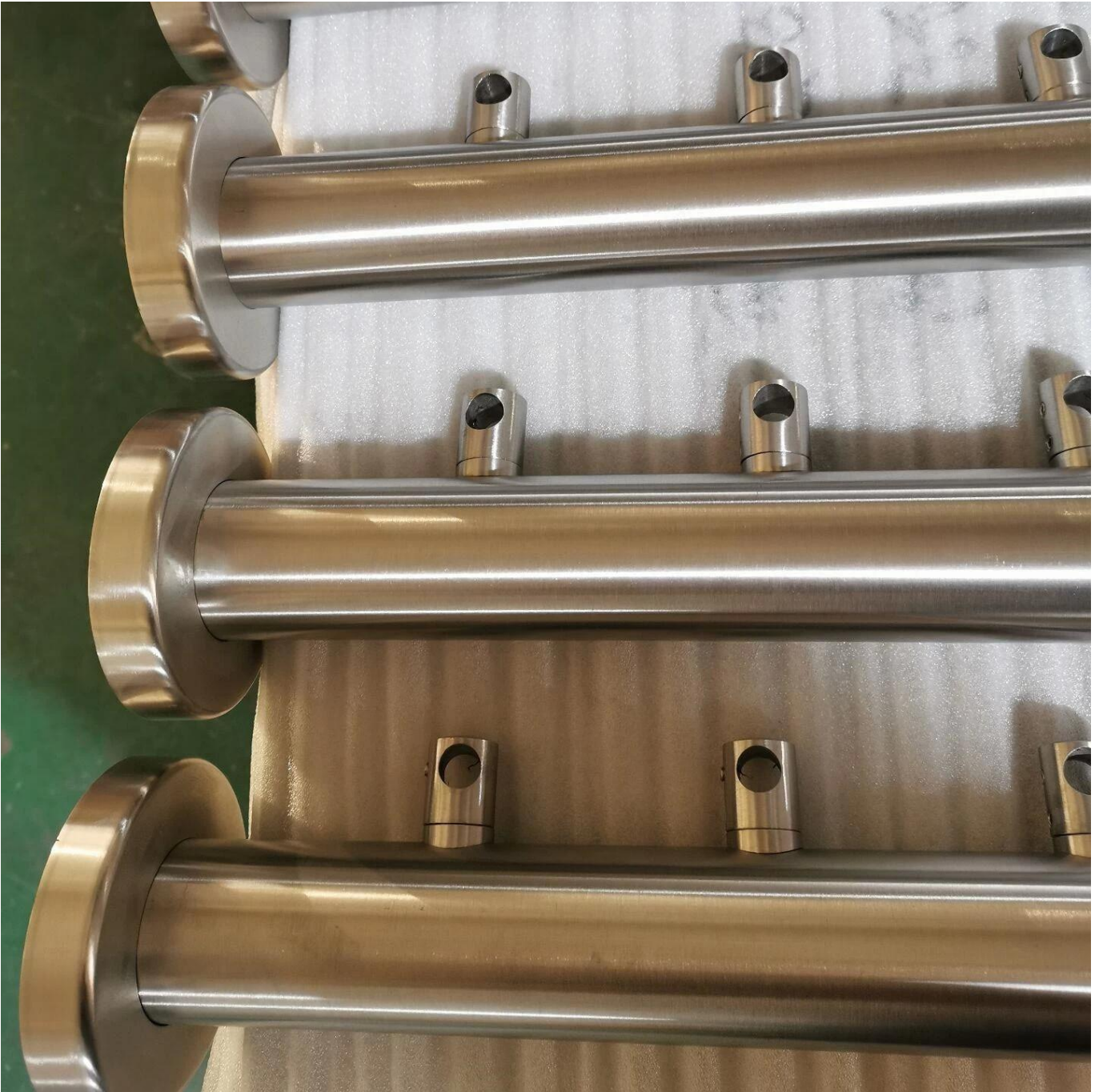
End cap & joints for cross bars: