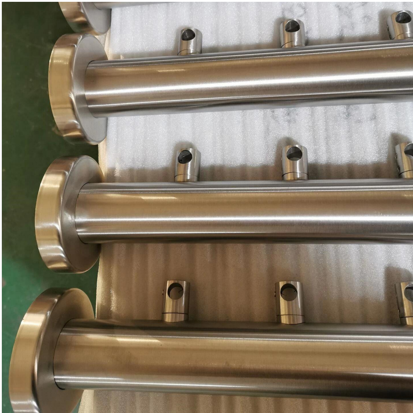
End cap & joints for cross bars: