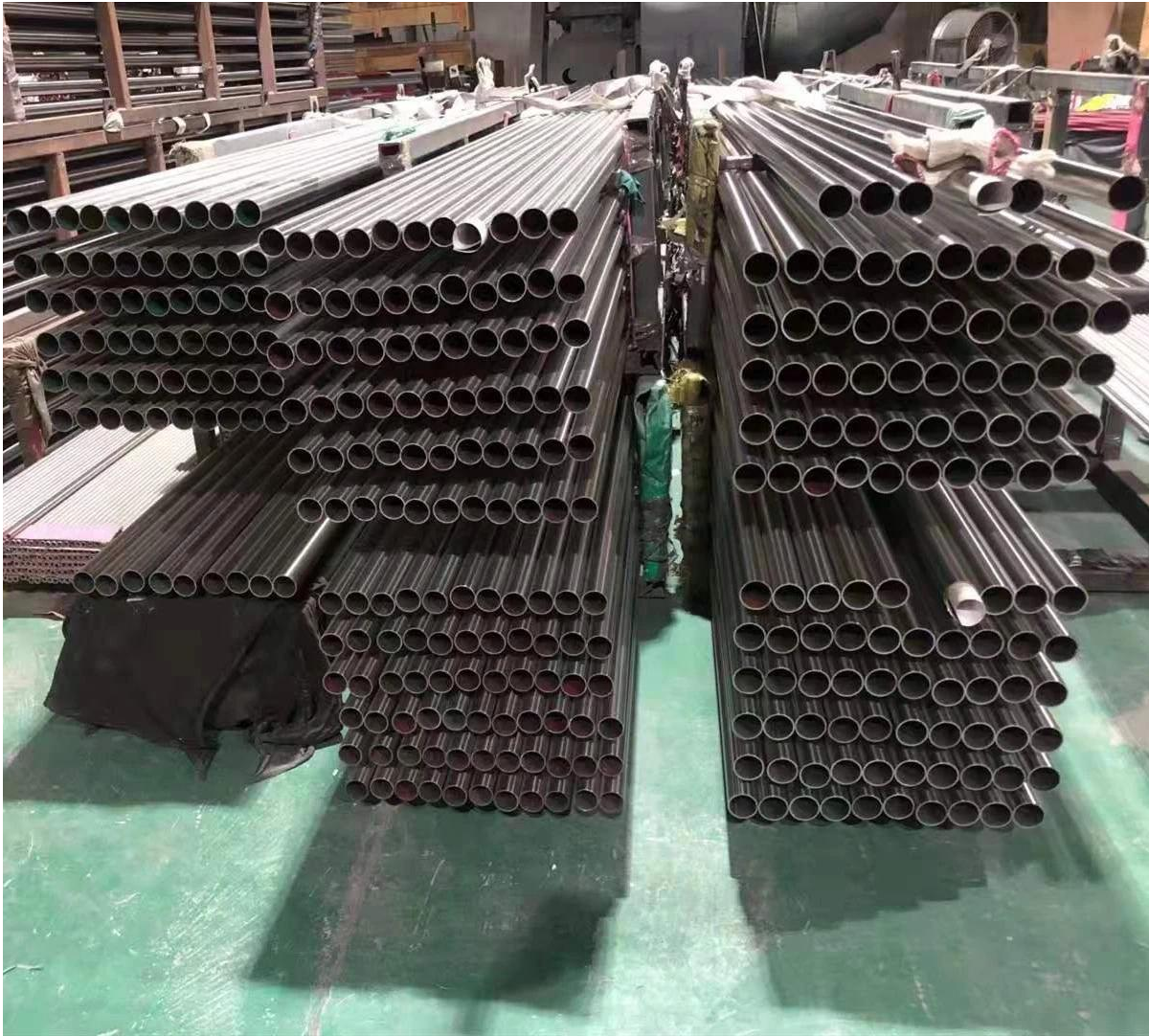
Black powder coating stainless steel balustrade tube pipe