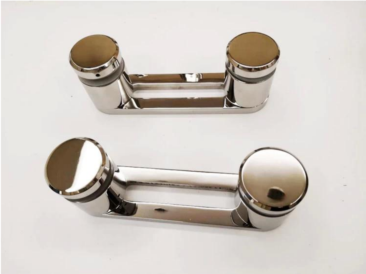
Project galleries with Stainless Steel Wall Mount Glass Standoff Holder -