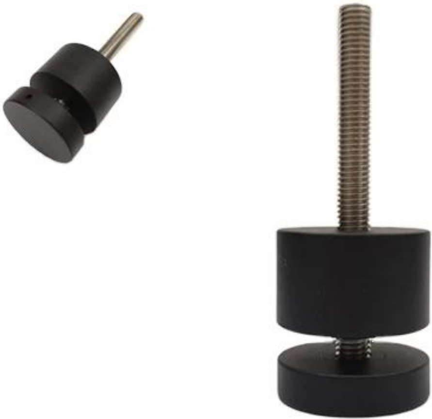
Various designs & sizes of Stainless Steel Wall Mount Glass Standoff Holder-