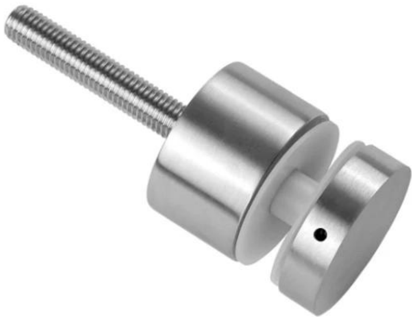
Satin finish Stainless Steel Wall Mount Glass Standoff Holder -