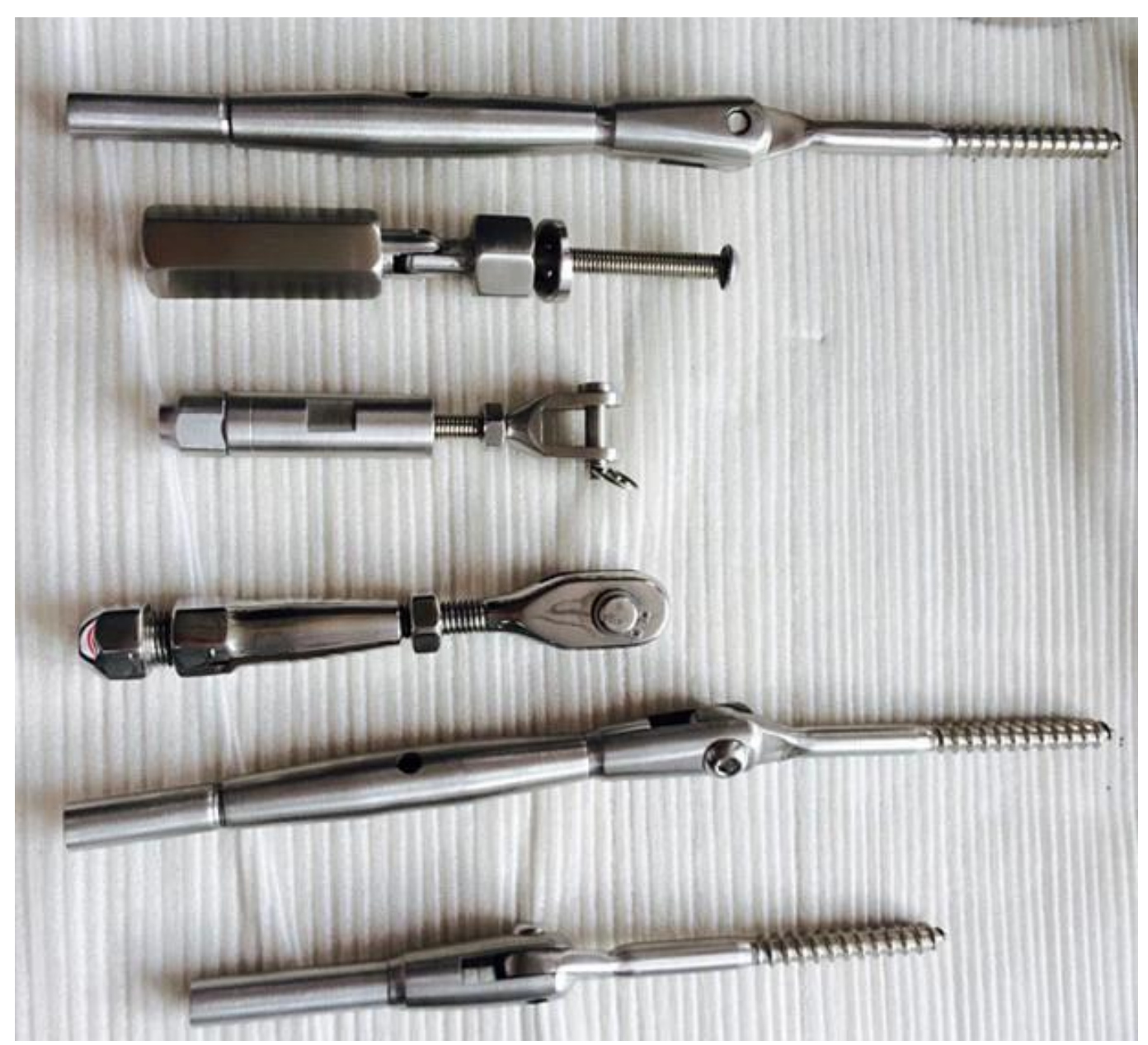
Welcome to contact us for more information: