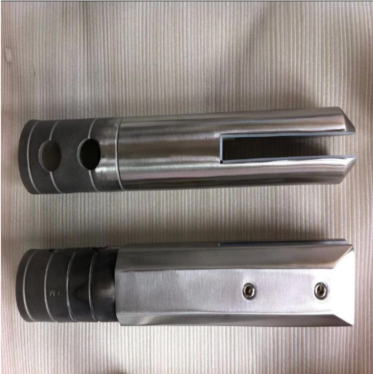
3.mini post with cover ring