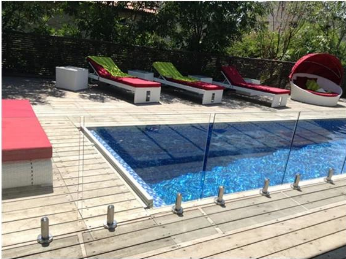
frameless glass balustrade