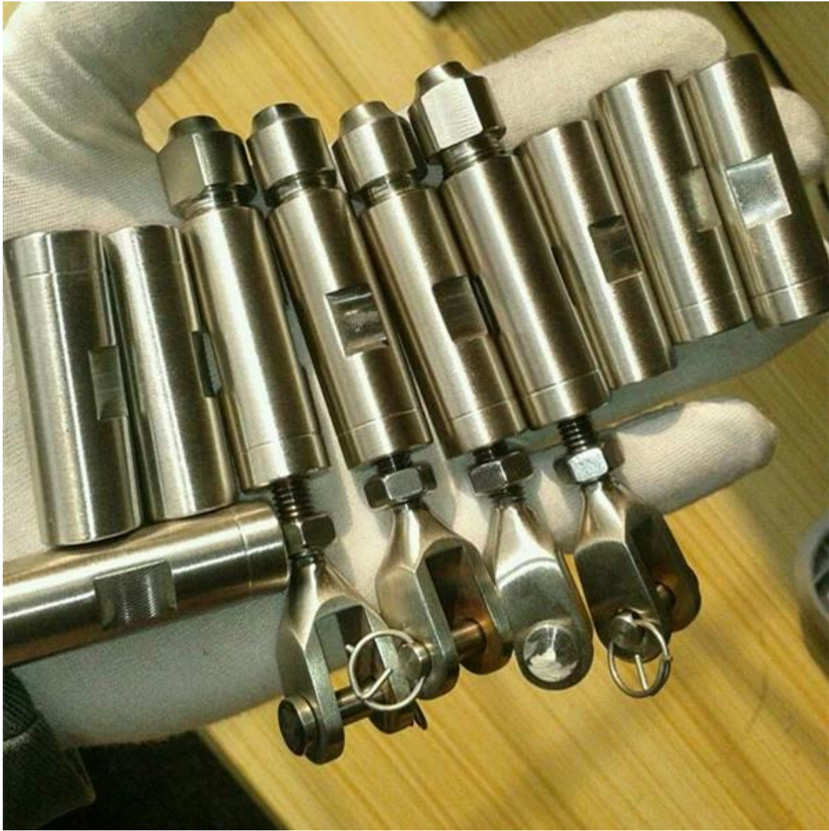
Project in L.A California