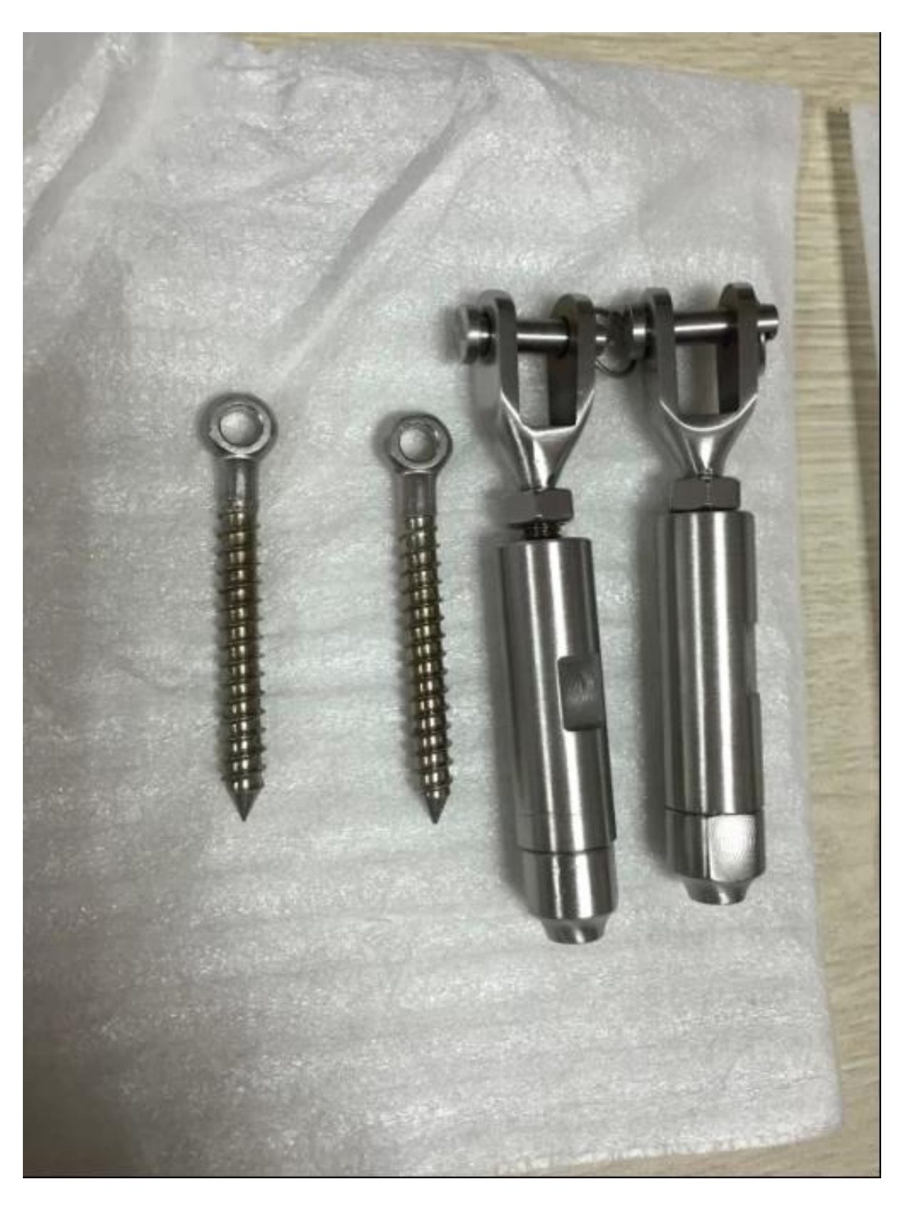
Cable tensioner for stainless steel post