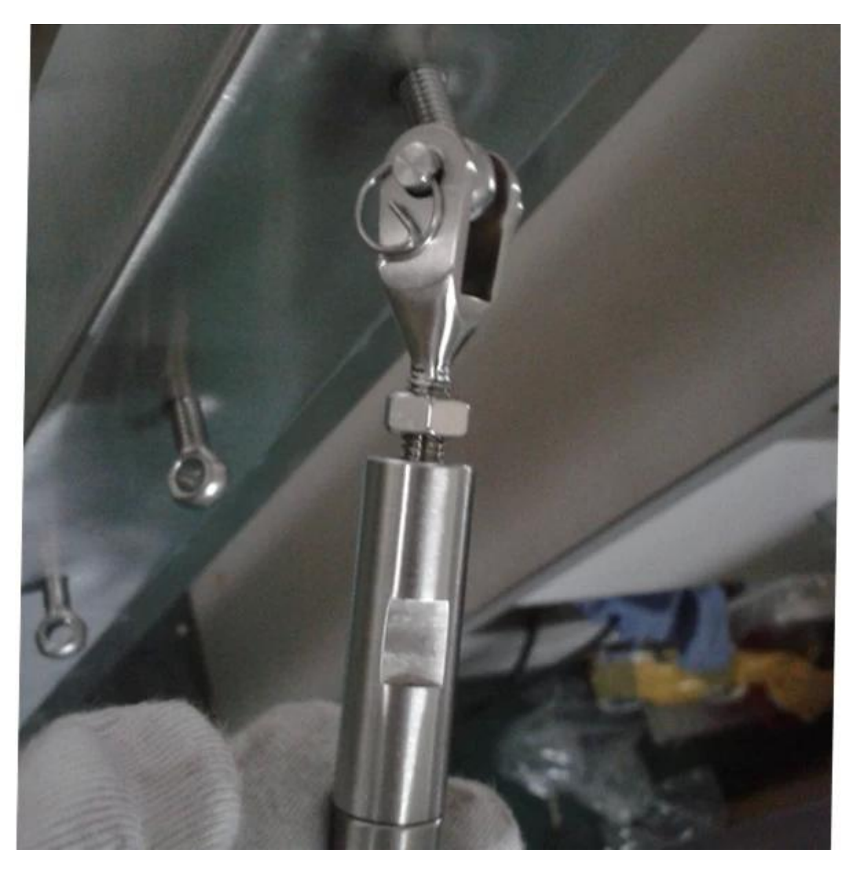
Cable tensioner T803 size