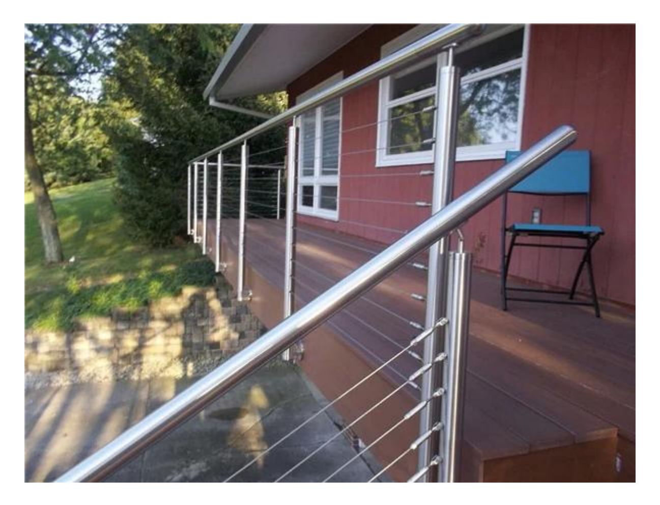
Associcated products you might interested Stainless steel wire rope