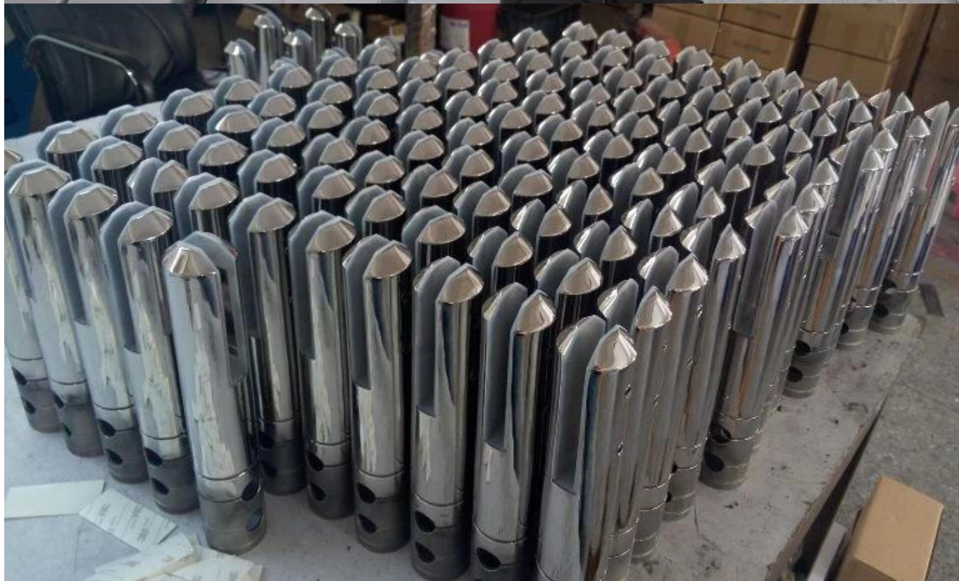
Glass Pool Fence Spigot Safety Packaging