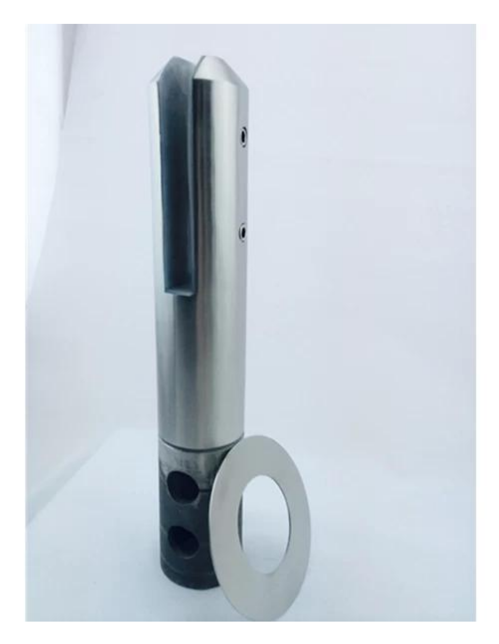
Mirror Position spigot for frameless glass balustrade, spigot for frameless glass railing