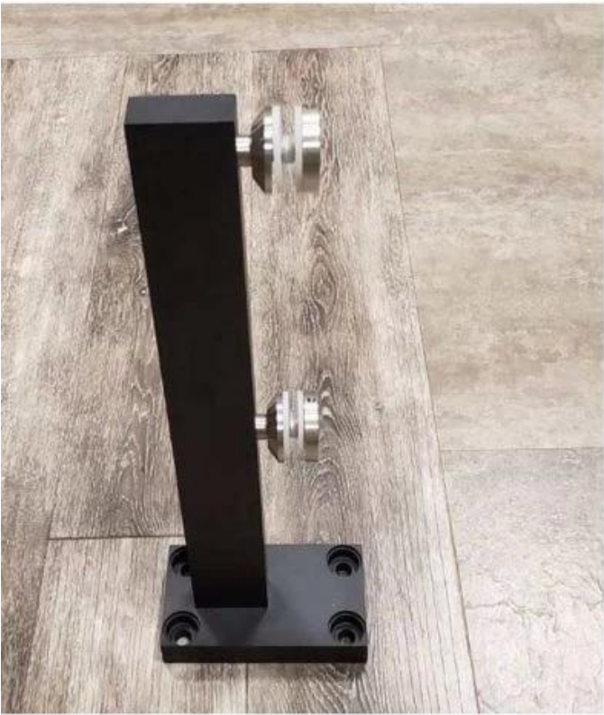
Post drawing for reference: