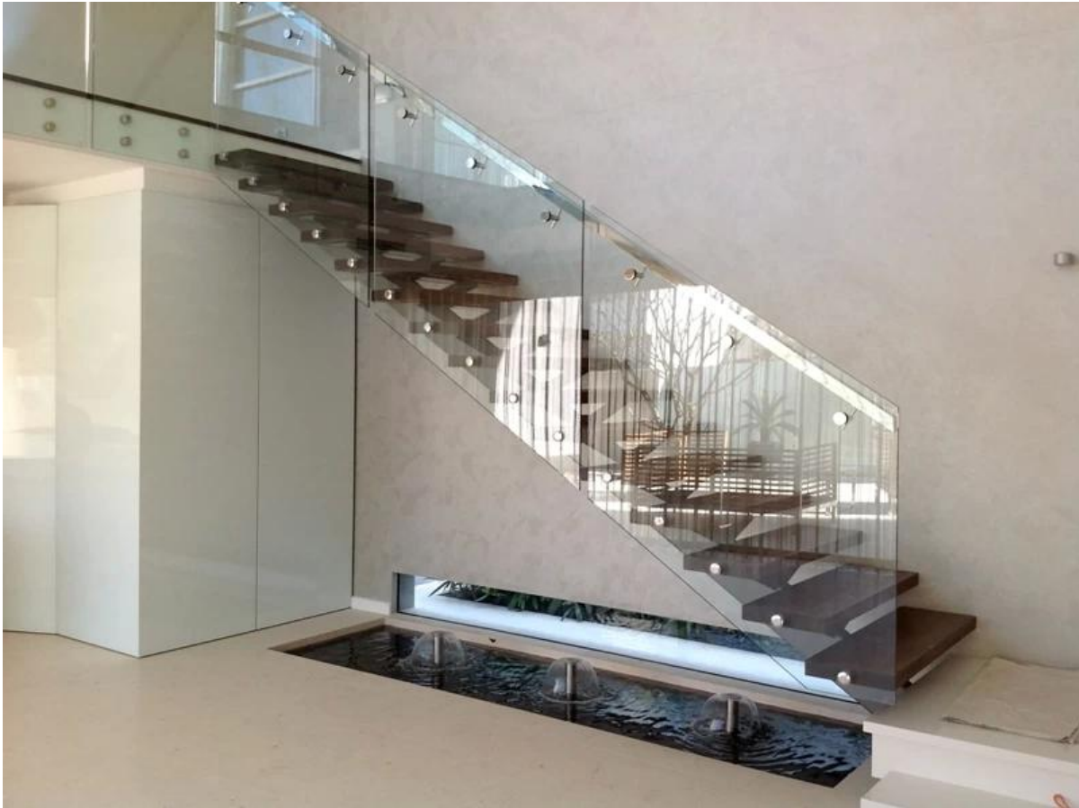
Stainless steel glass standoff for frameless glass balustrade