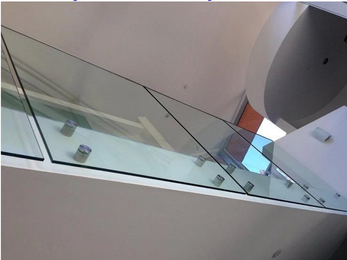
stainless steel standoff, bracket for glass panels, railing design