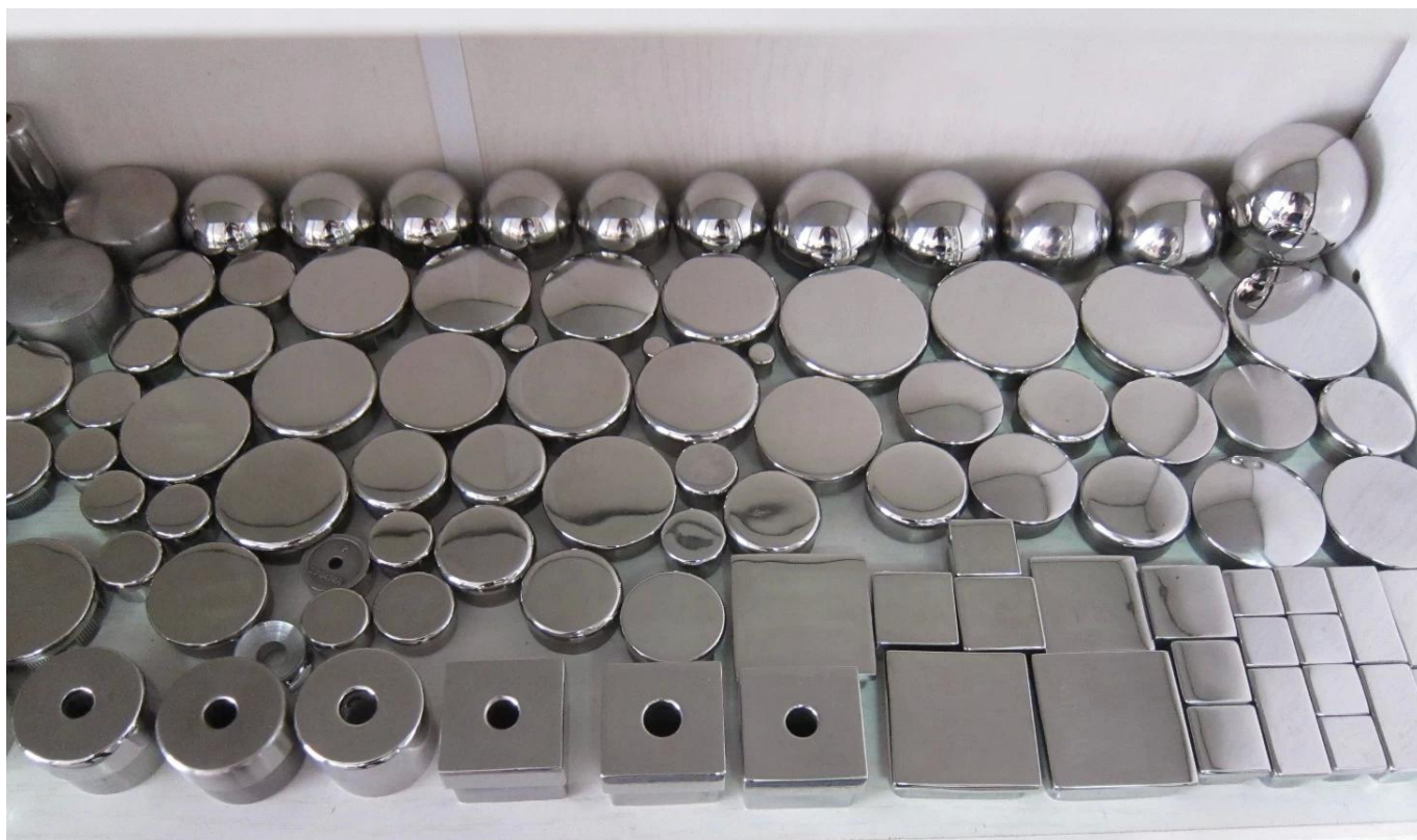
Project photos of Stainless steel handrail end cap / Banister end caps -