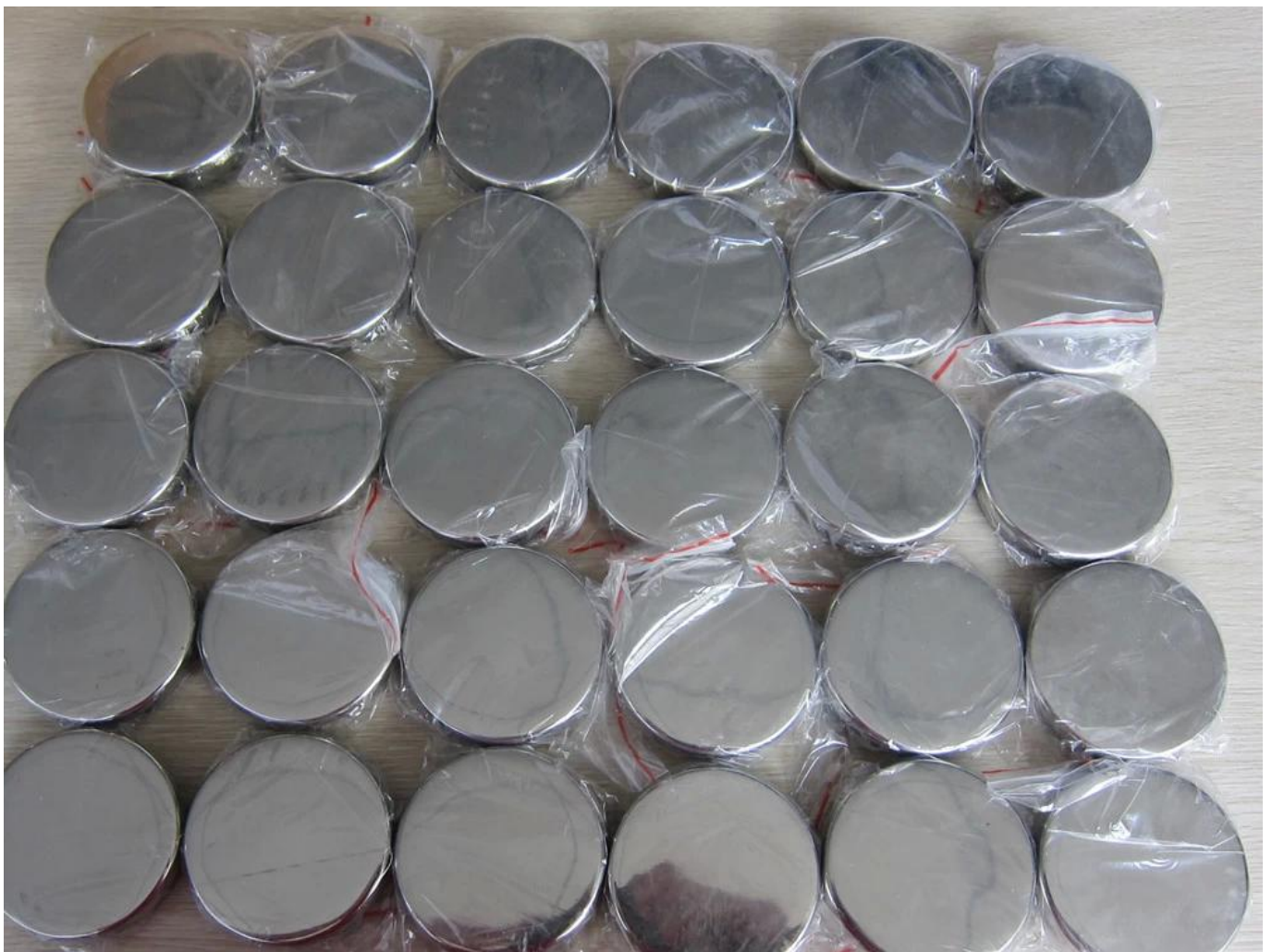
3 more designs of Stainless steel handrail end cap / Banister end caps -