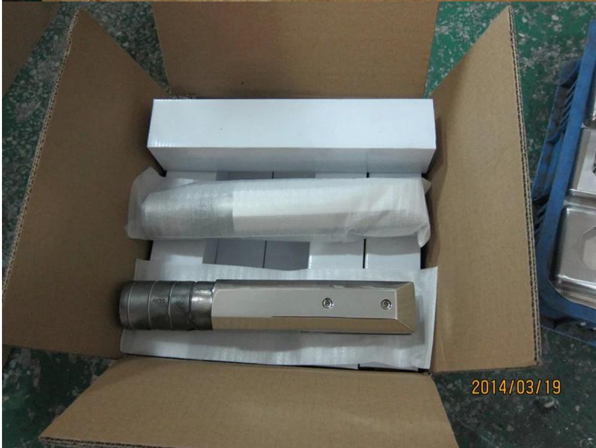
Glass Spigot Project Pictures