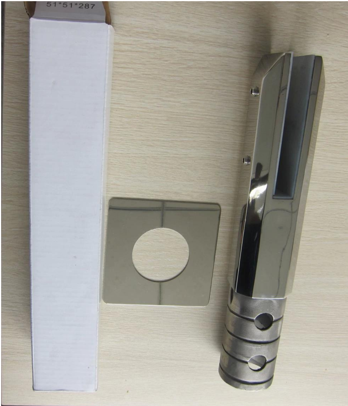
-satin brushed glass spigot