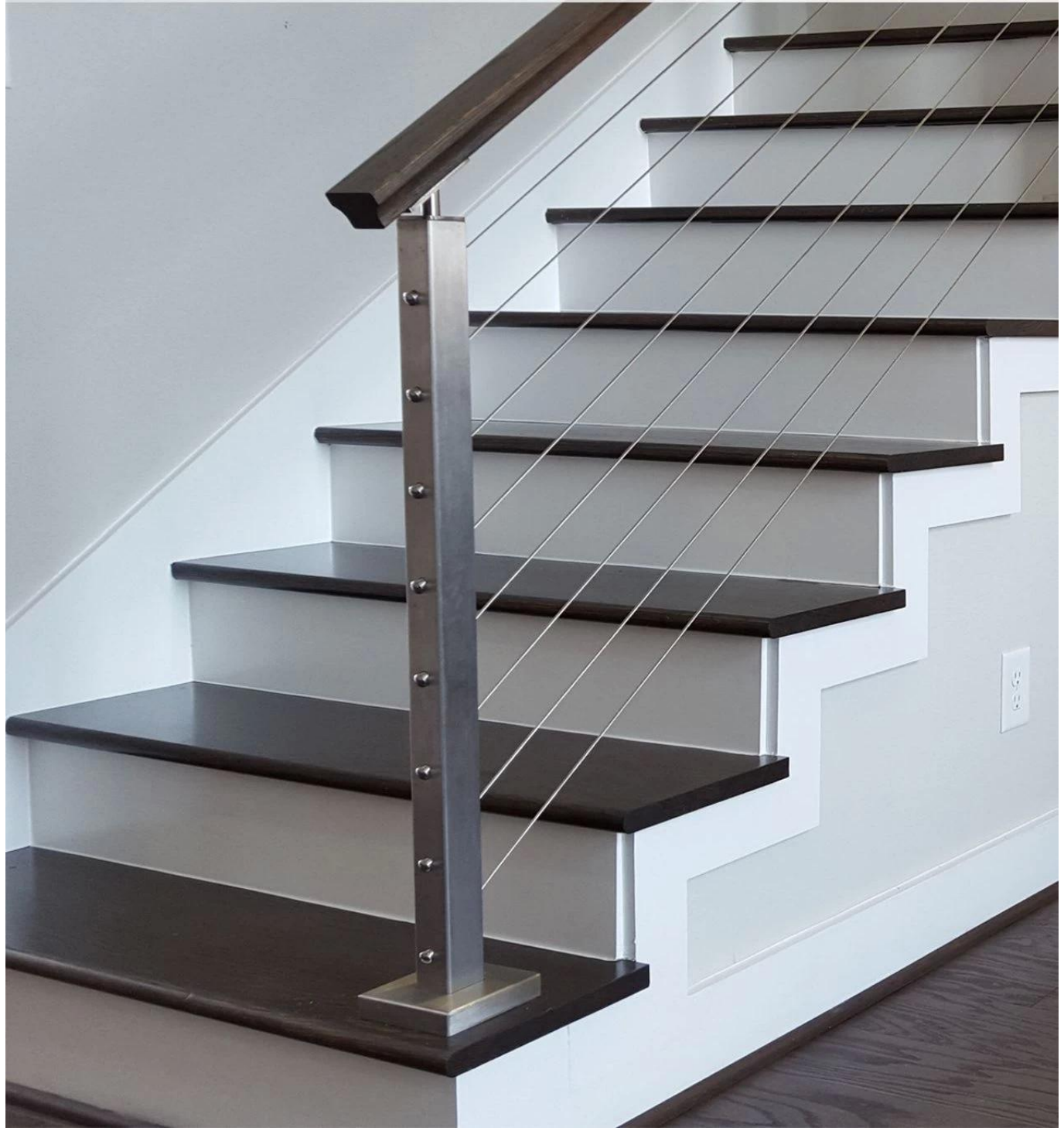
Type 316 stainless steel has the best corrosion resistance among standard stainless steels. It resists pitting and corrosion by most chemicals, and is particular resistant to saltwater corrosion.

These can be used for a variety of applications. Sail boats and yachts, cable railing, and for shade sails.