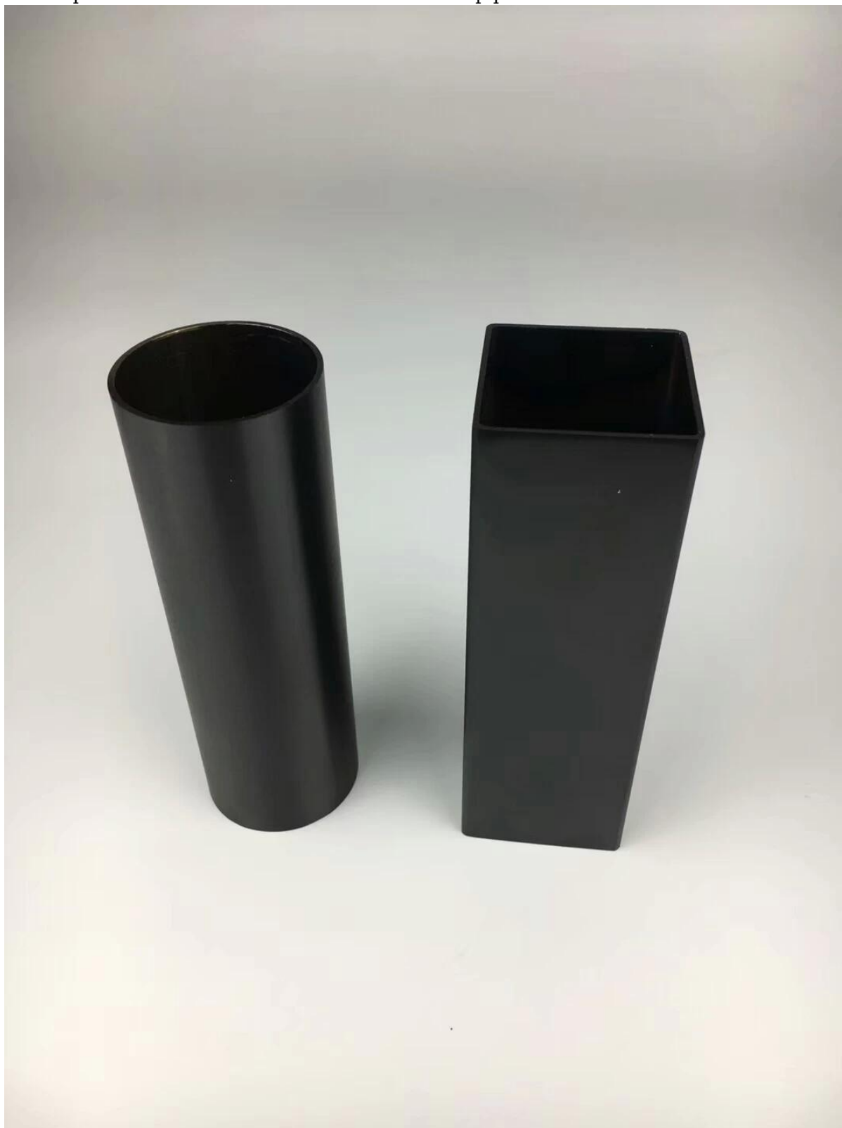
Electroplate gold stainless steel balustrade tube pipe