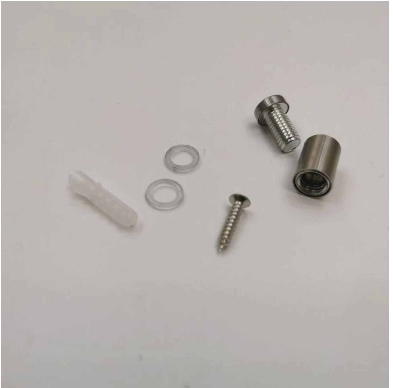
Mass production and packing